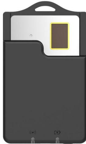
Figure 1: Tactilis Badge Carrier and Card

Tactilis Badge Carrier provides communication interfaces for applications to connect to and use the Tactilis Biometric Card. The Carrier has a slot for inserting and carrying the Tactilis Card. Applications can connect to the Carrier using USB, Bluetooth Low Energy (BLE) or Wi-Fi