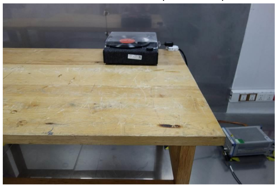
Radiated Emissions which fall in the restricted bands

Conducted Emissions at AC Power Line (150kHz-30MHz)