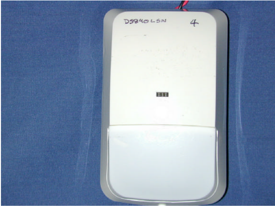
External View Front