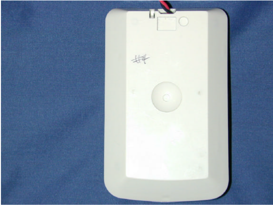
External View, Rear