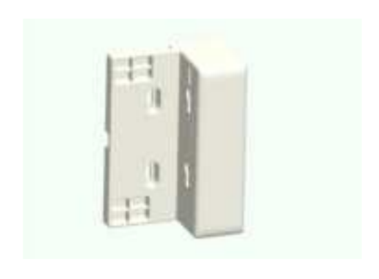
Image 23: Front view of Power Cradle DC Power with Access Point attached