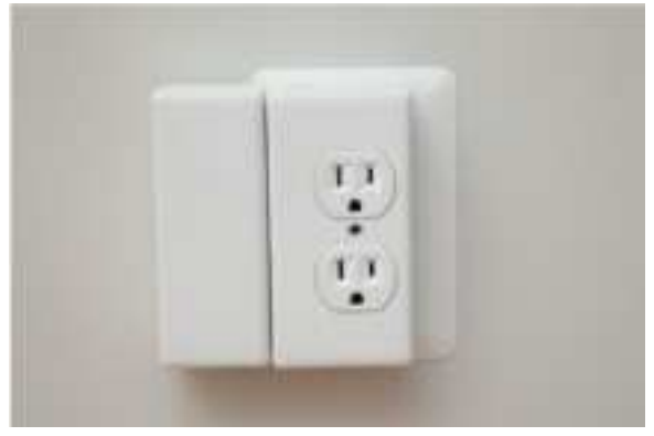
Figure 9: Front view of Location Beacon AC Power (right) with Access Point attached (left)