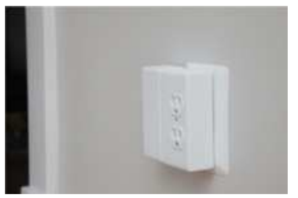
Figure 10: Side view of Location Beacon AC Power (right) with Access Point attached (left