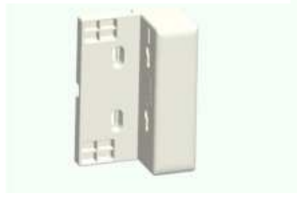
Beacon fits into Power Cradle DC Power