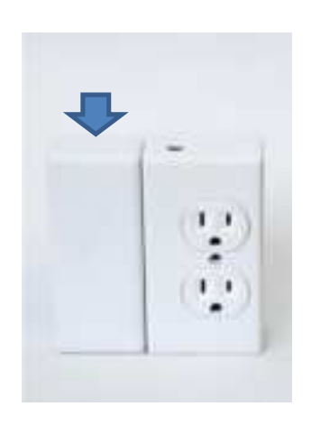
Figure 14: Rear view of Access Point (right) attached to Power Cradle AC Power (left)

Figure 13: Front view of Access Point (left) attached to Power Cradle AC Power (right)