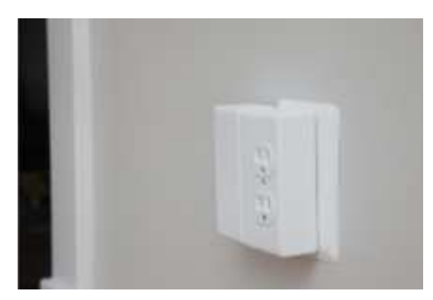
Figure 5: Location Beacon AC Power with external power cable inserted.