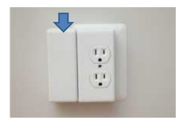
Figure 16: Side view of Access Point (left) attached Power Cradle AC Power (right

Figure 15: Front view of Access Point (left) attached to Power Cradle AC Power (right)