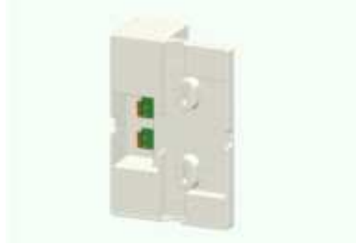
Image 24: Rear view of Power Cradle DC Power with Access Point attached