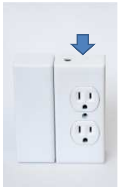
Figure 7: Front view of Location Beacon AC Power (right) with Beacon AC Power (left) with Accord Boint attached (left) Access Point attached (right)