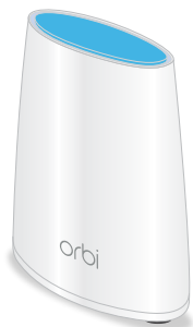
Orbi Router (Model RBR40)