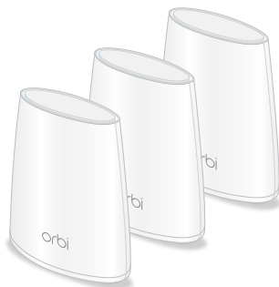
Orbi Satellite (3) (Model RBS20)