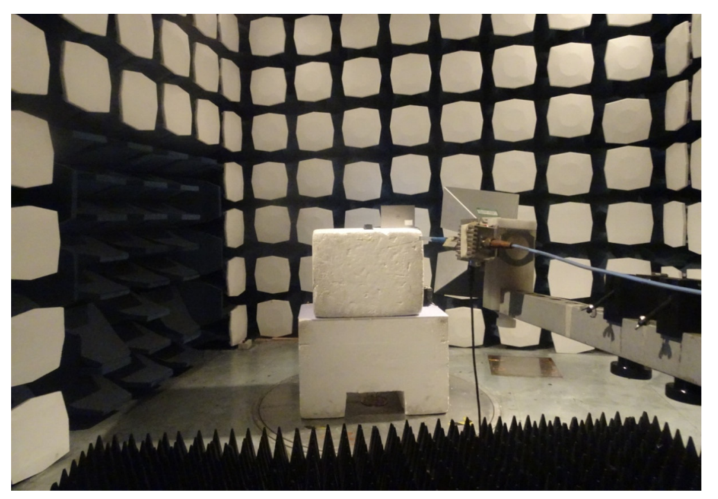
1GHz-18GHz Picture 1: Radiated Spurious Emissions Test setup