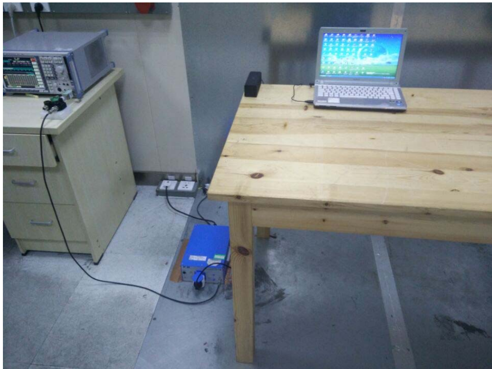
Radiated Spurious Emissions From 30MHz-1000MHz