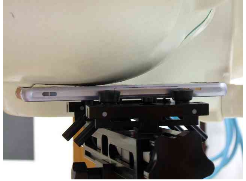
- Cheek-Touch Position -