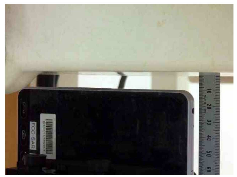
– Edge 4 (Left) –