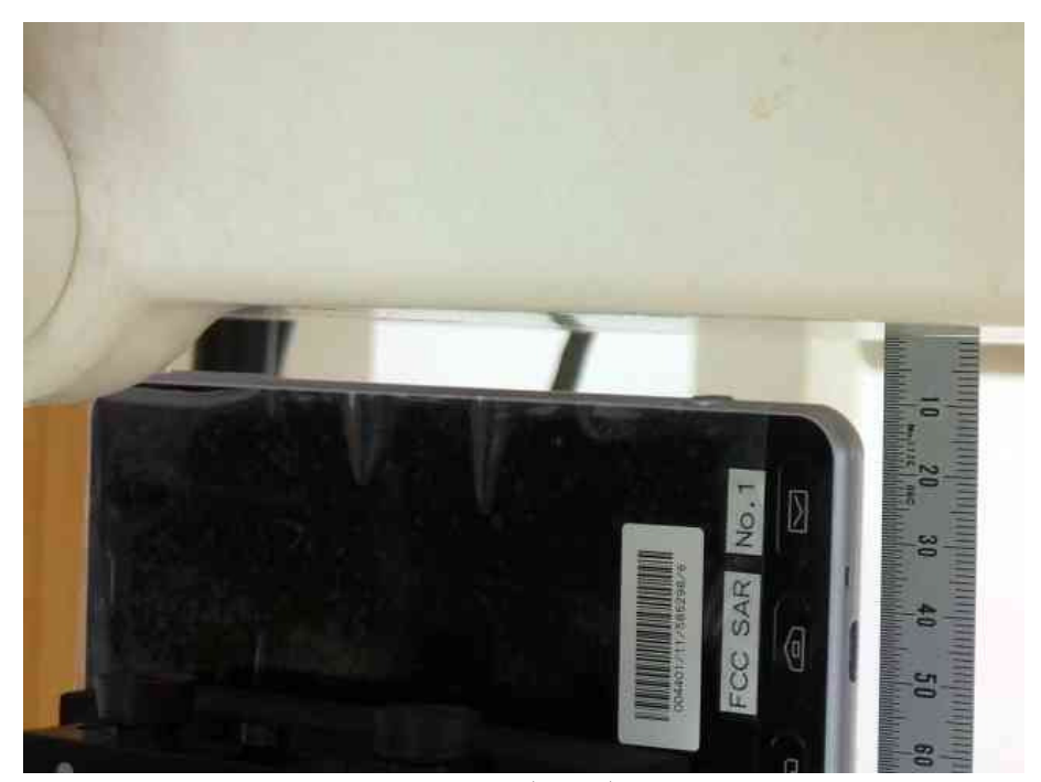
– Edge 2 (Right) –