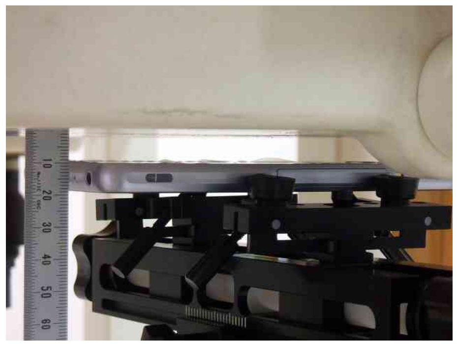
– Front –