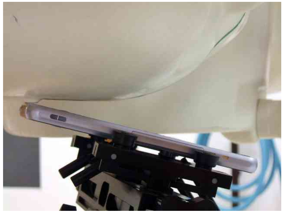
- Ear-Tilt Position -