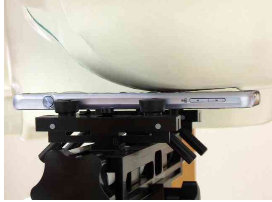
- Cheek-Touch Position -