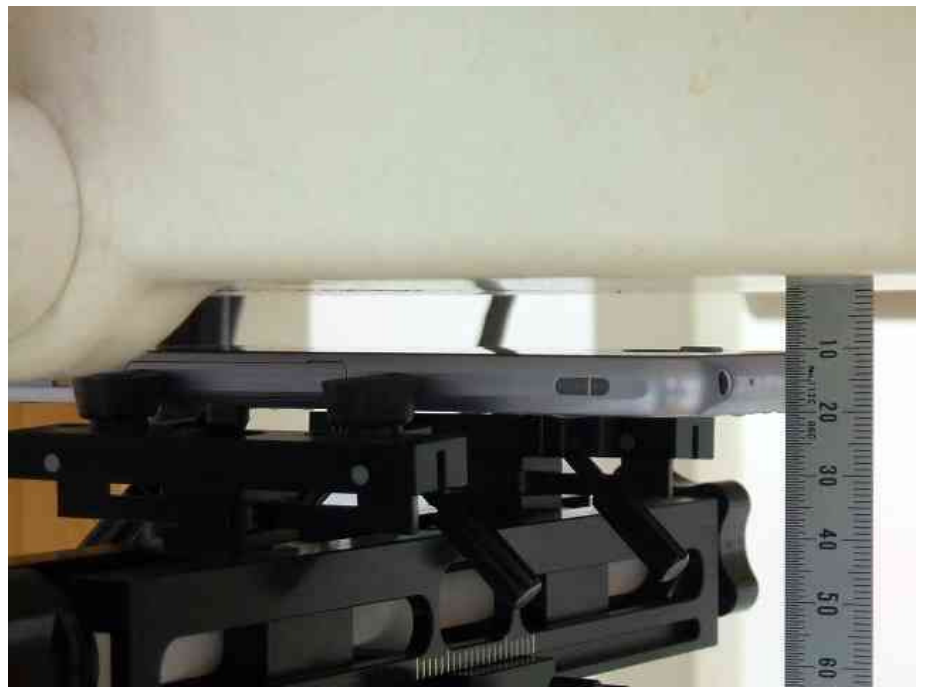
– Rear –