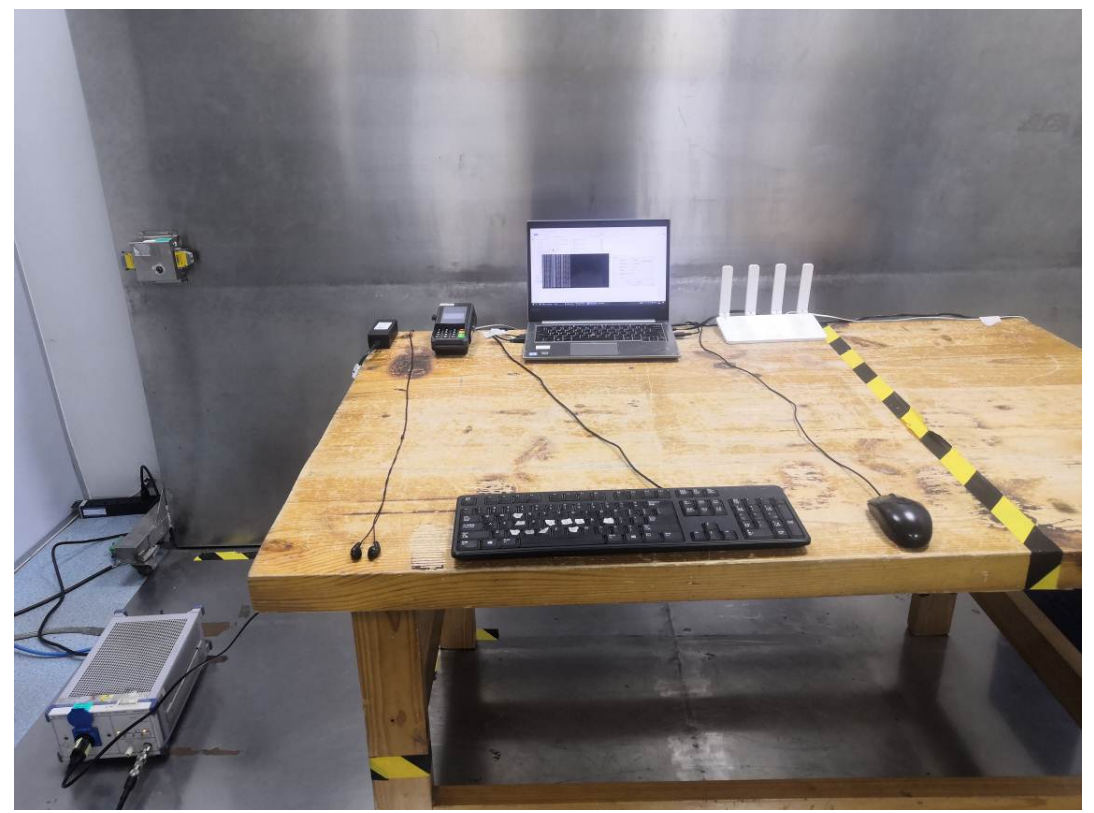
Conducted Emissions Side View