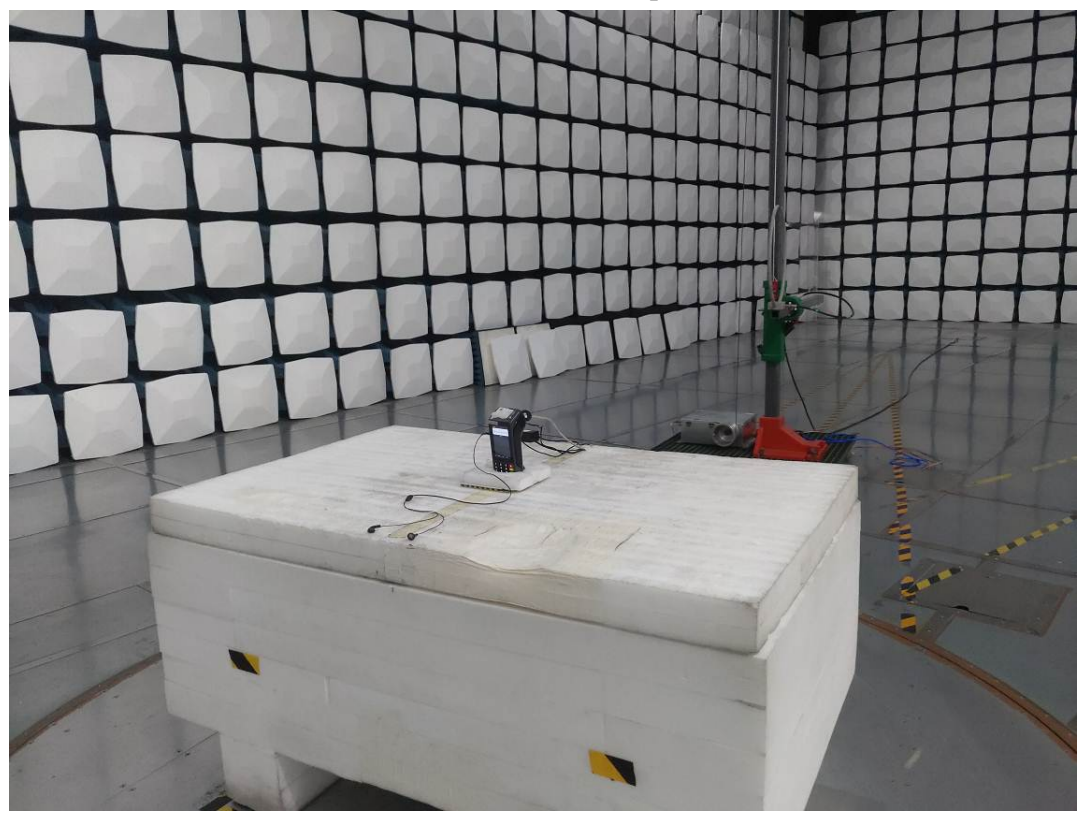
Radiated Emission 9k-30MHz Perpendicular View

Radiated Emission 9k-30MHz Parallel View