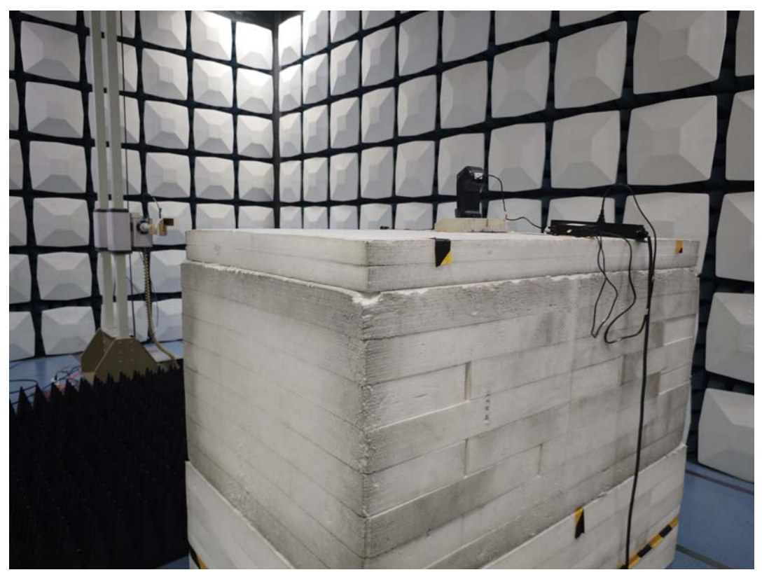
Radiated Emission 18-25GHz View