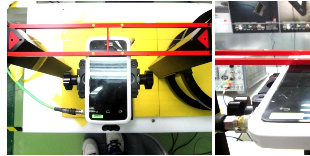
Top View Bottom View