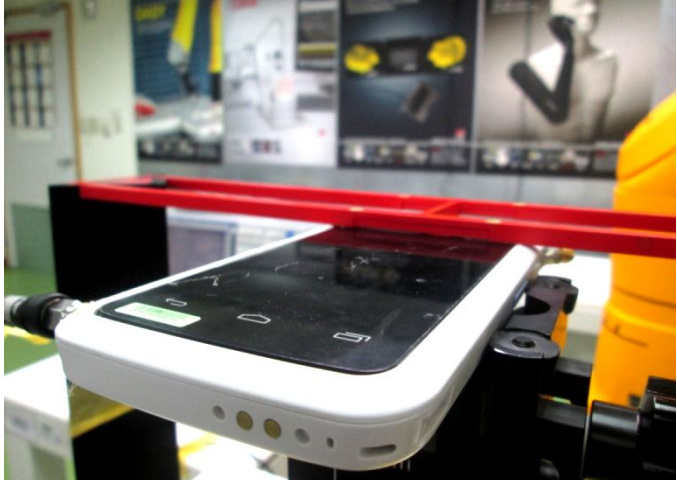
Left Side View Right Side View