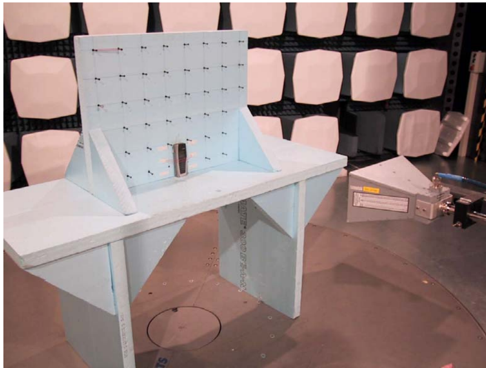
Picture 3: Radiated spurious emission measurement set-up for above 3 GHz measurements, EUT in vertical orientation