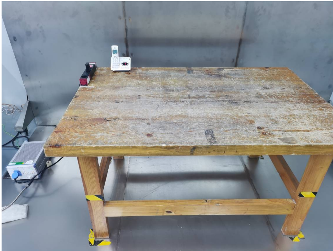
Conducted Emissions Side View-for Adapter A318-060040W-US1