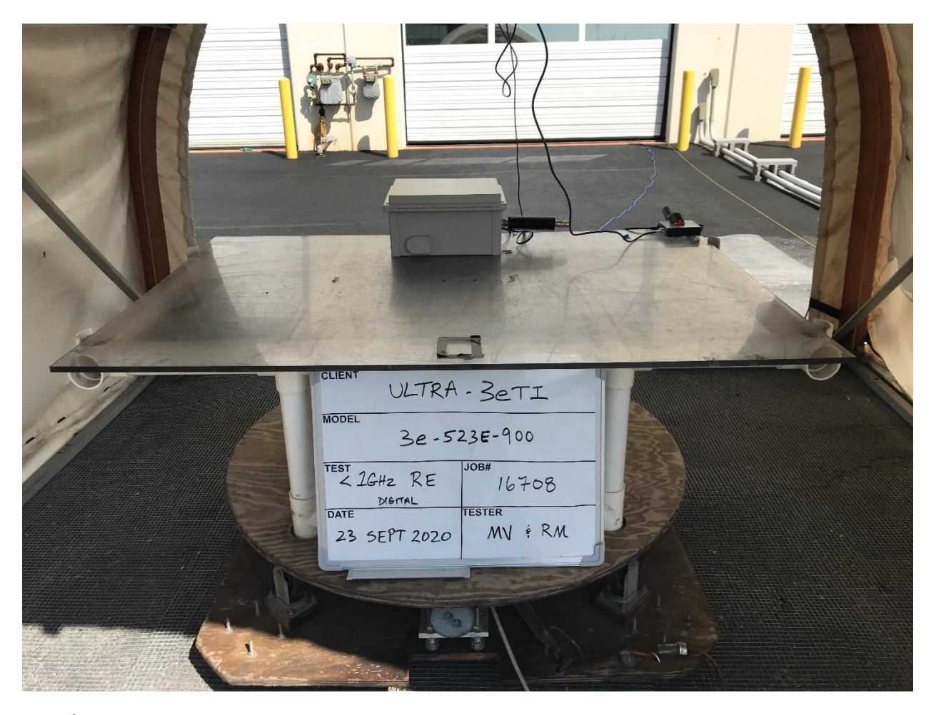
Digital RE Front