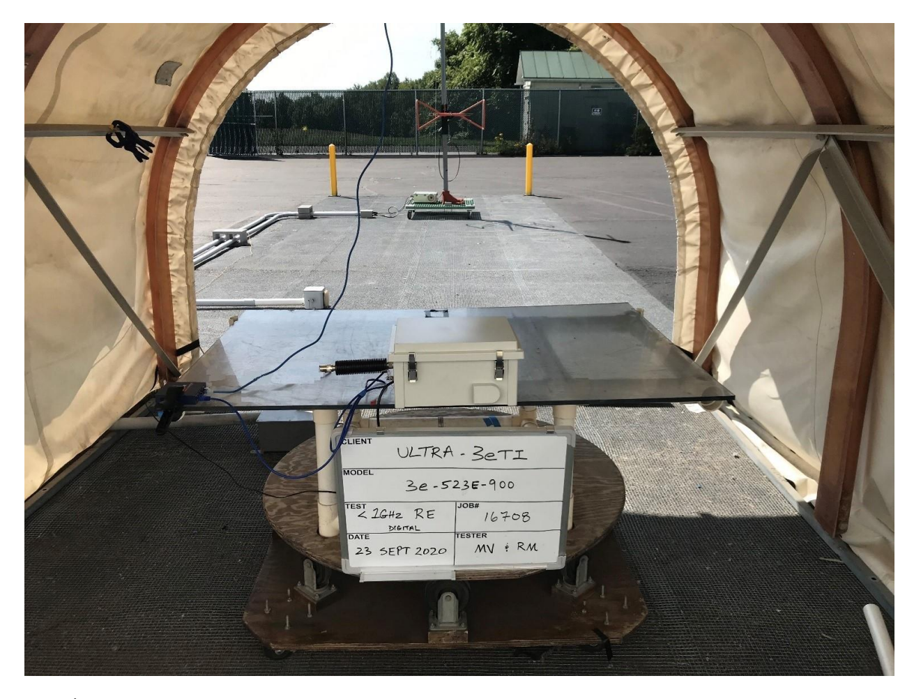
Digital RE Rear