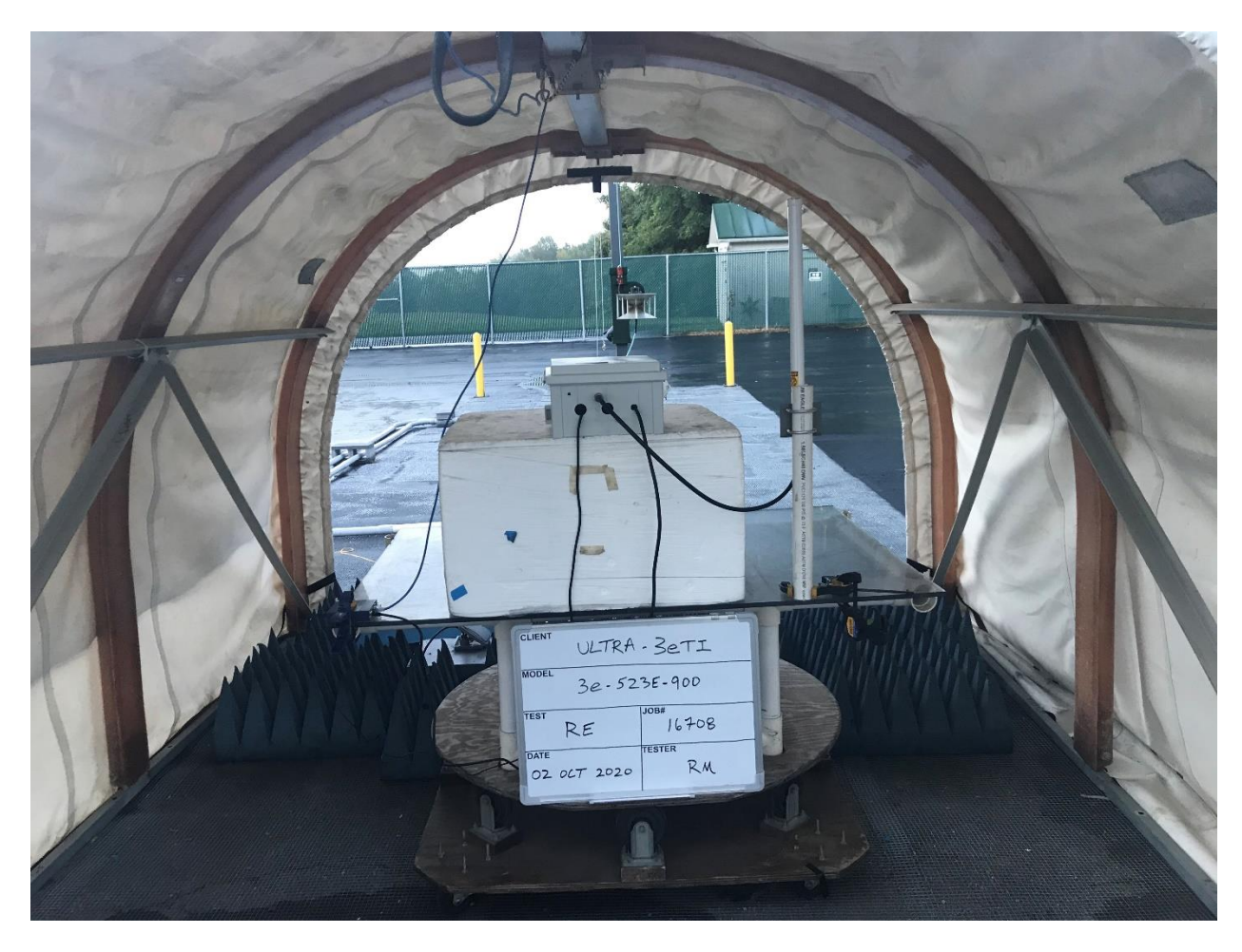
RE 1-10GHz OMNI Rear