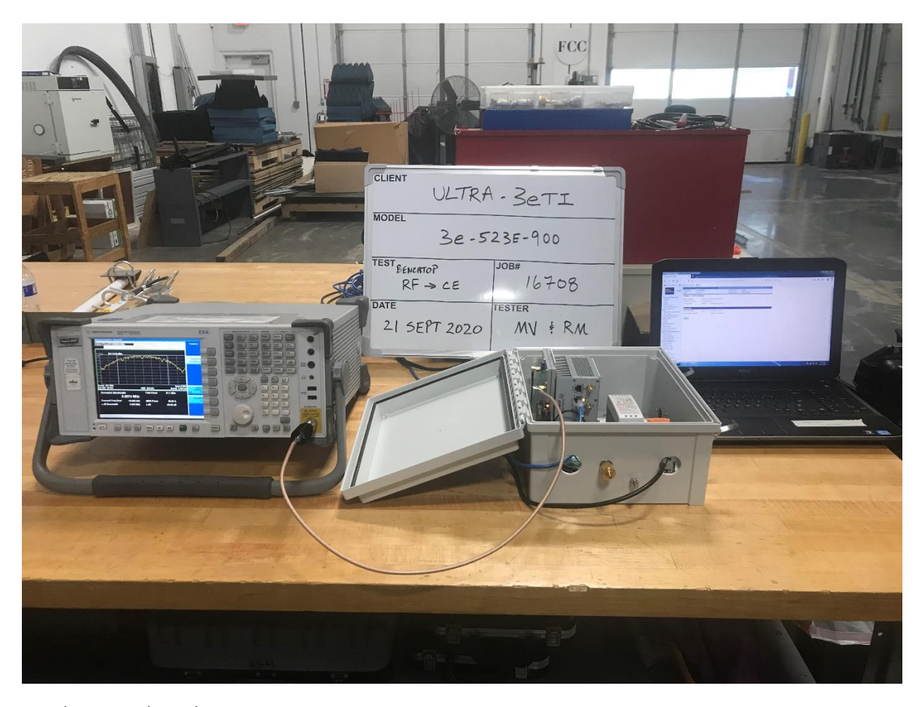
Benchtop Conducted Setup