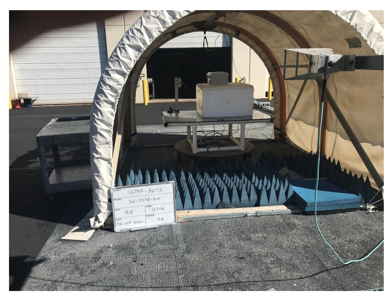
RE 1-10GHz YAGI Front