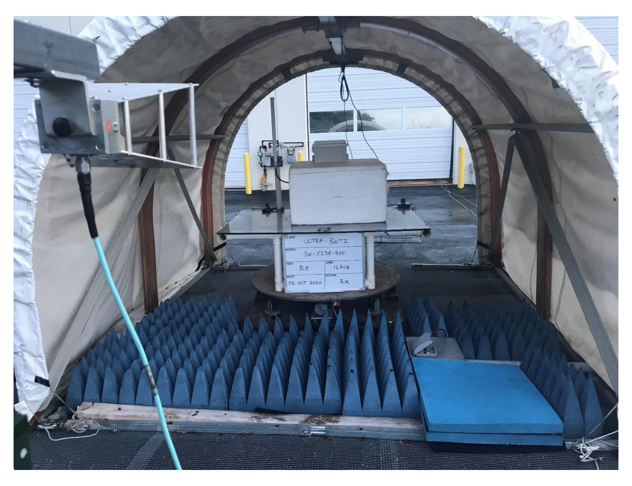
RE 1-10GHz OMNI Front