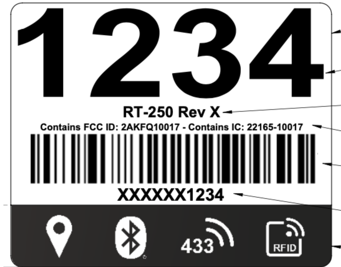
Sample Host Label 1