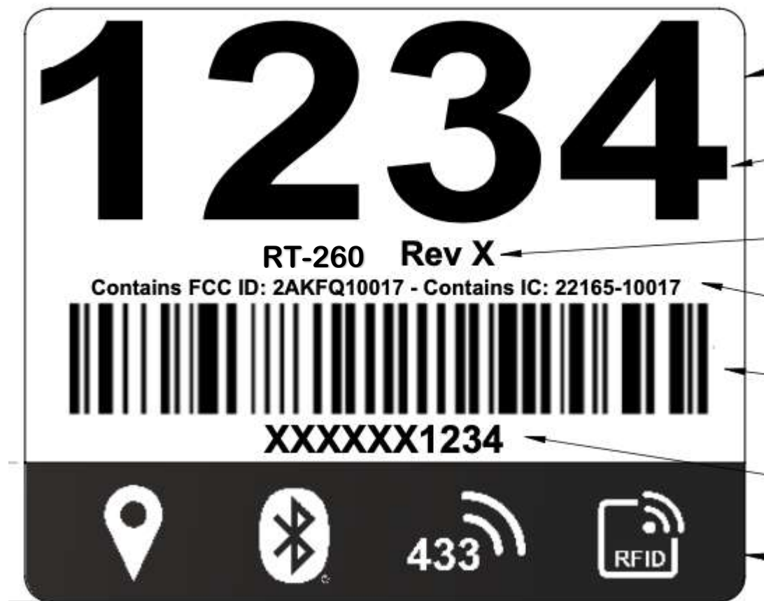
Sample Host Label 2