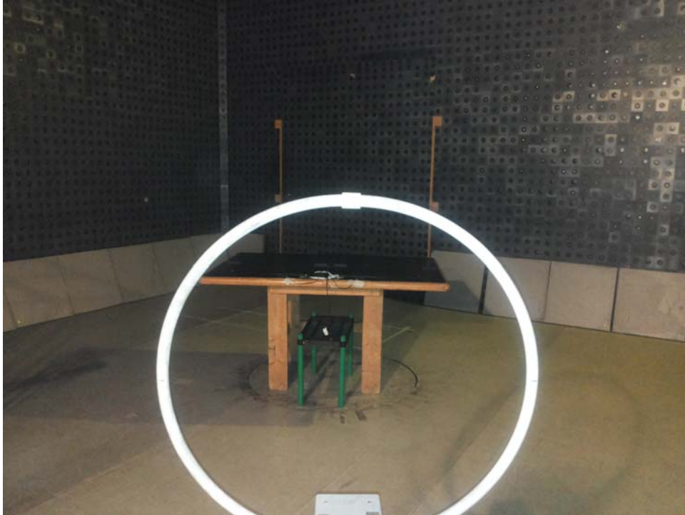
Photograph No.1 Spurious emissions field strength measurement setup in the anechoic chamber below 30 MHz