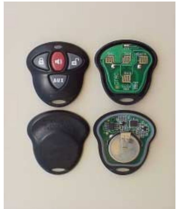
Photo 2 Original 4 button configuration. Again, same PCB is used for either 3 or 4 button configuration.