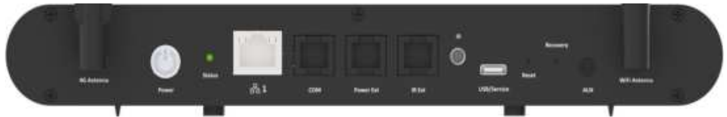
Figure 1 Interface definition diagram-Power