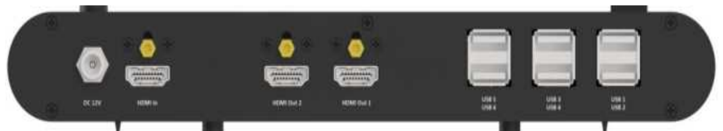
Figure 3 Interface definition diagram-2HDMI