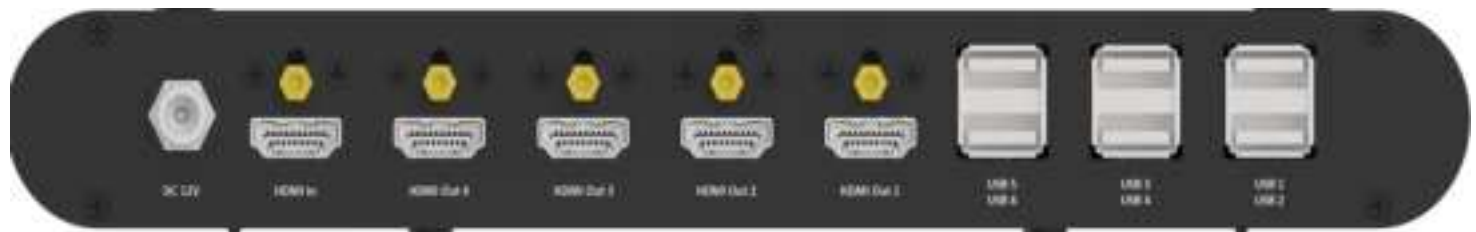
Figure 2 Interface definition diagram-4HDMI