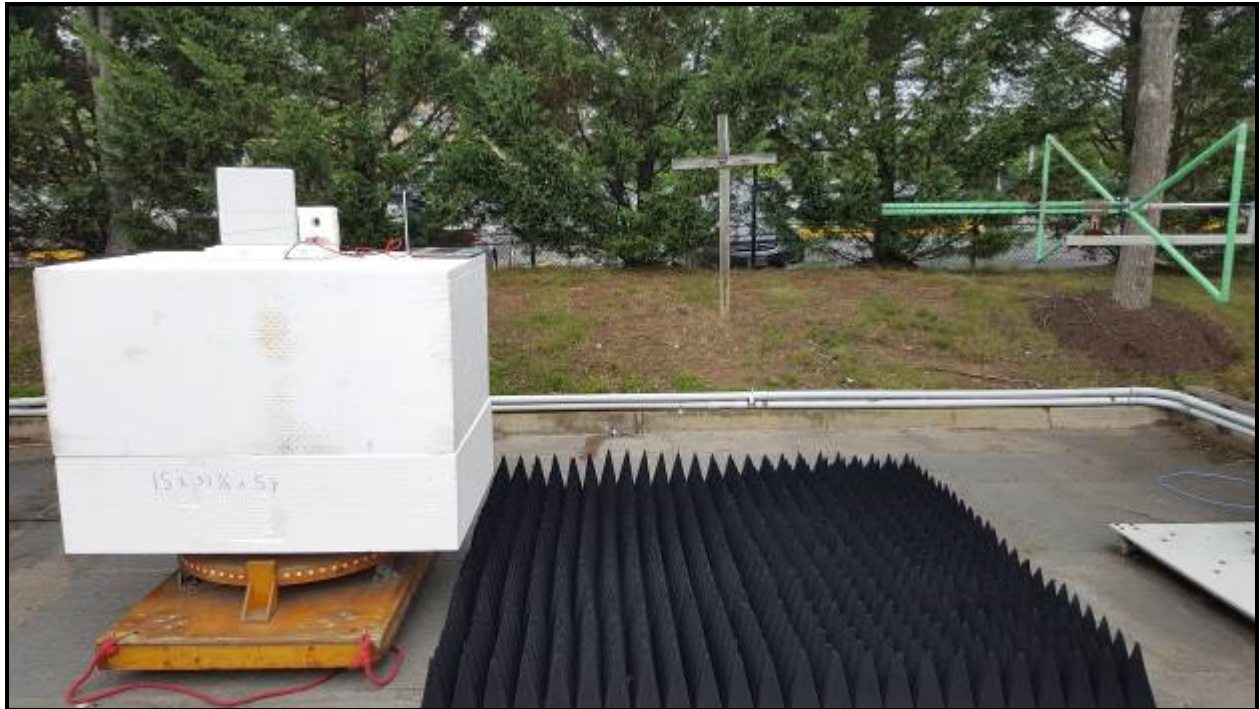
Photograph 3: Radiated Emissions, Above 1 GHz