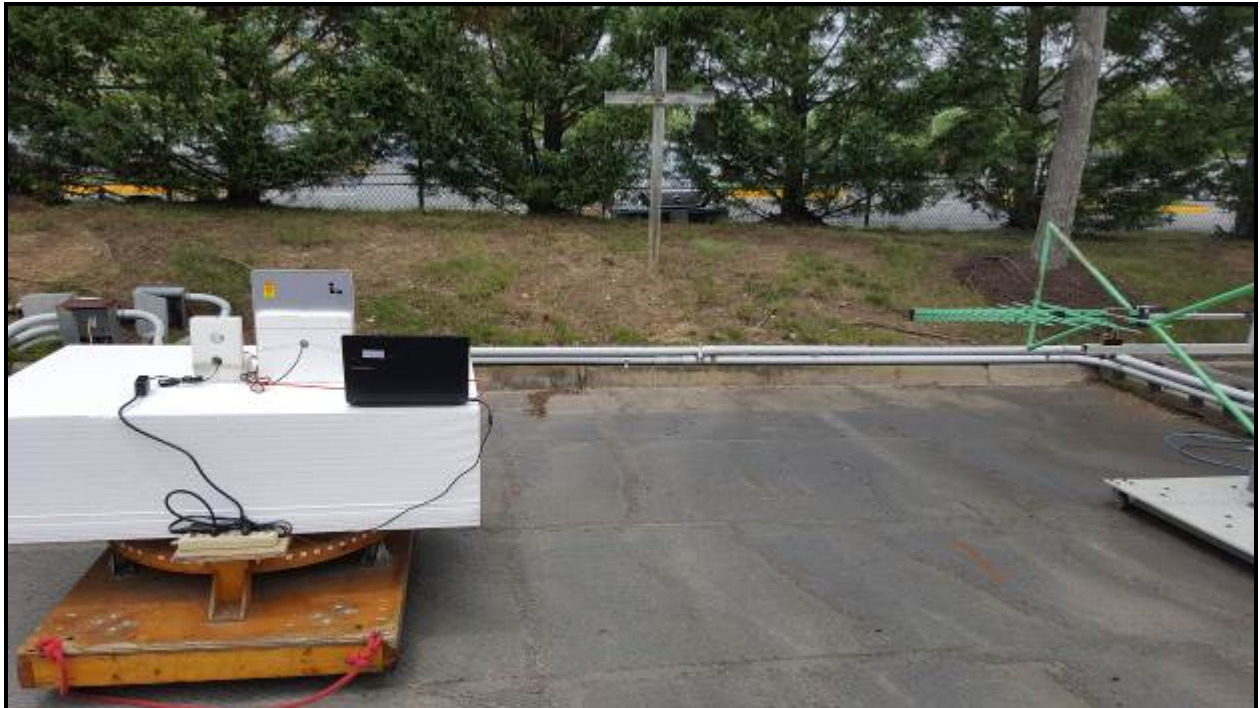
Photograph 1: Radiated Emissions, Below 1 GHz, Rear