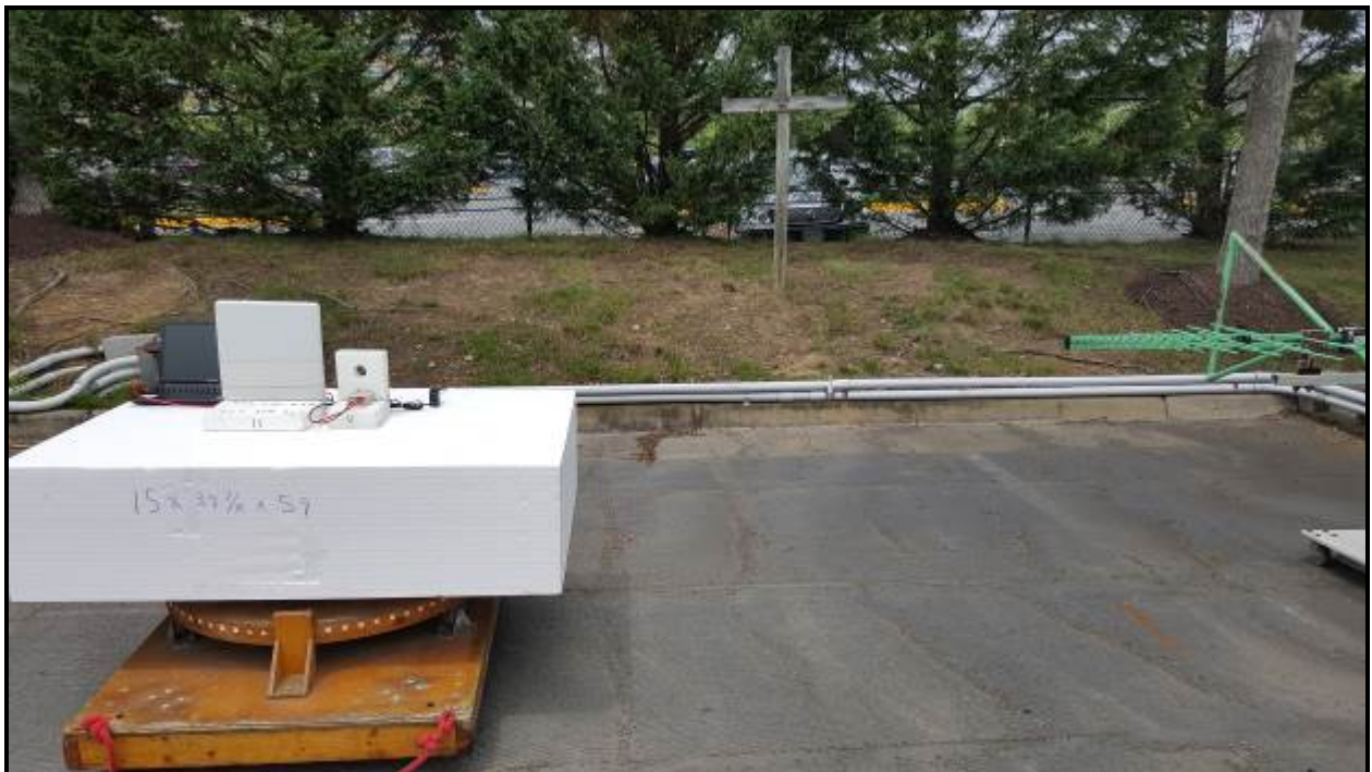
Photograph 2: Radiated Emissions, Below 1 GHz, Front