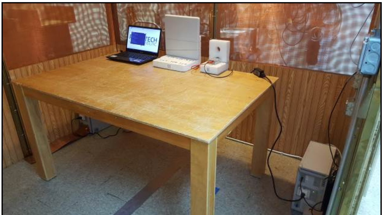
Photograph 6: Conducted Emissions