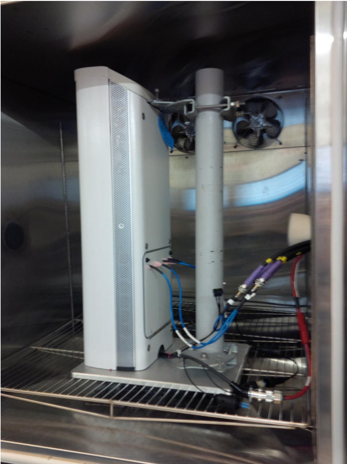
Figure 2: EUT in a thermal test chamber