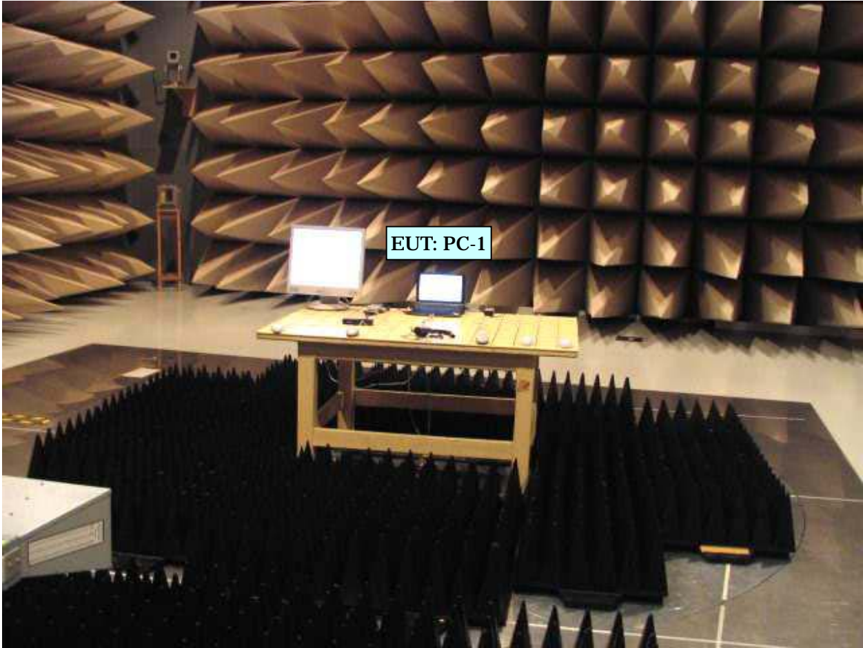
Photo-2.1 Conducted emission measurement