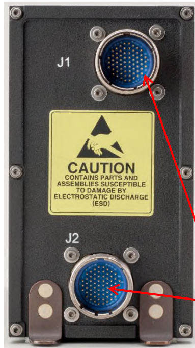
Figure 4: Rear View