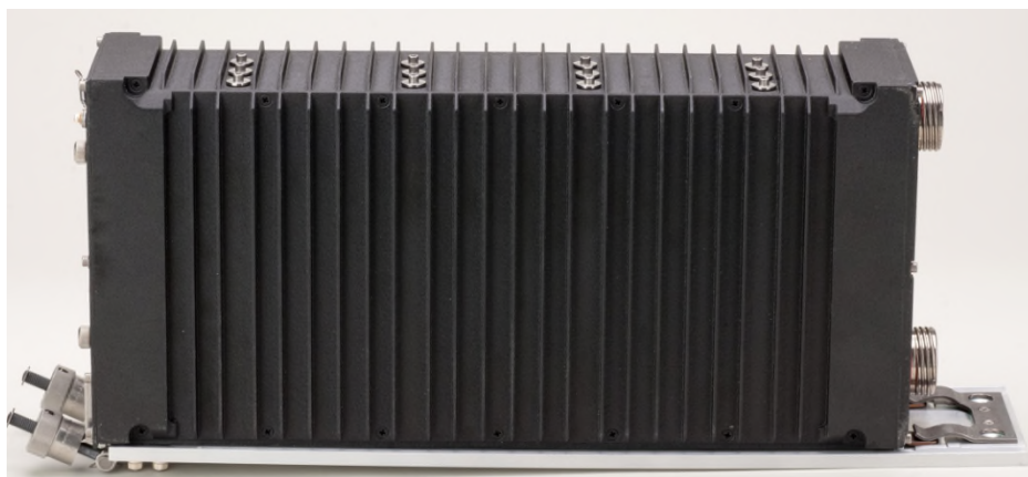
Figure 6: Right Side View