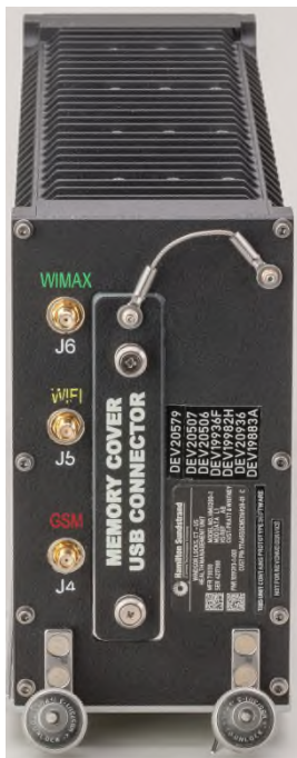
Figure 3: Front View