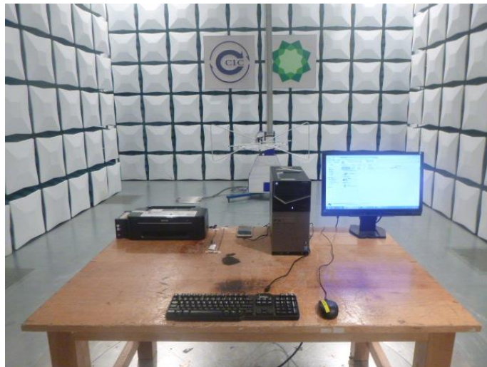
Radiated Emission (above 1GHz) Connect to PC