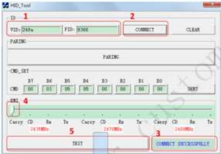
图 4-1 Dongle EMI 测试软件界面