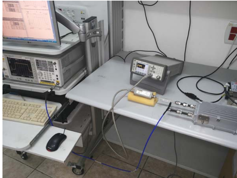
Photograph No.1 Peak output power, OBW measurement setup