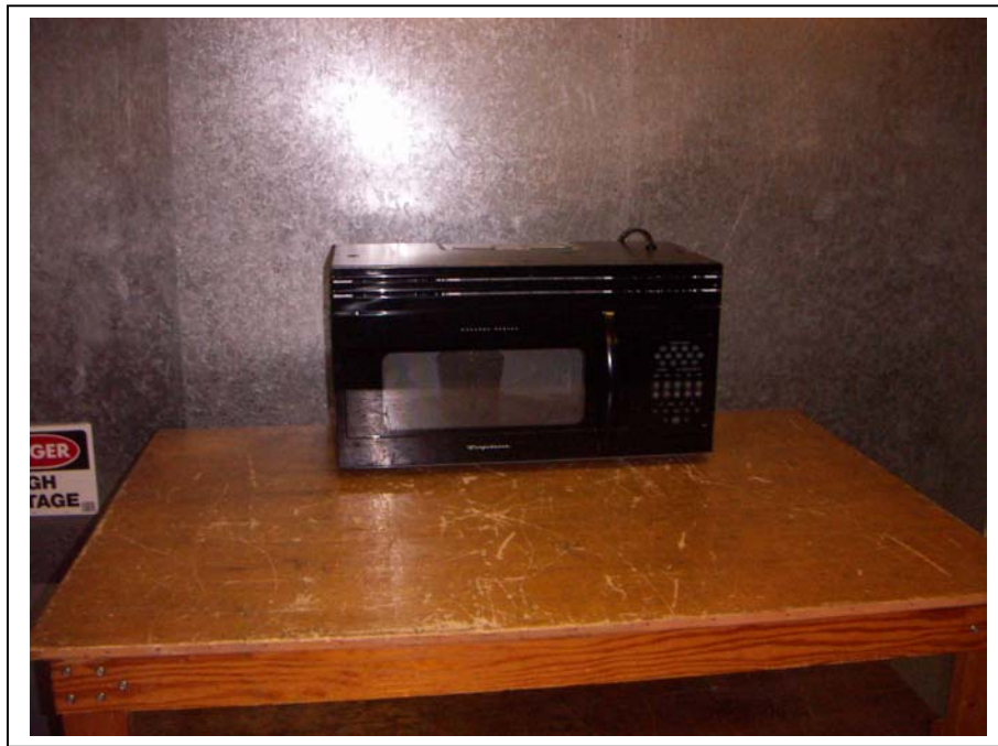
AC Line Conduction Front