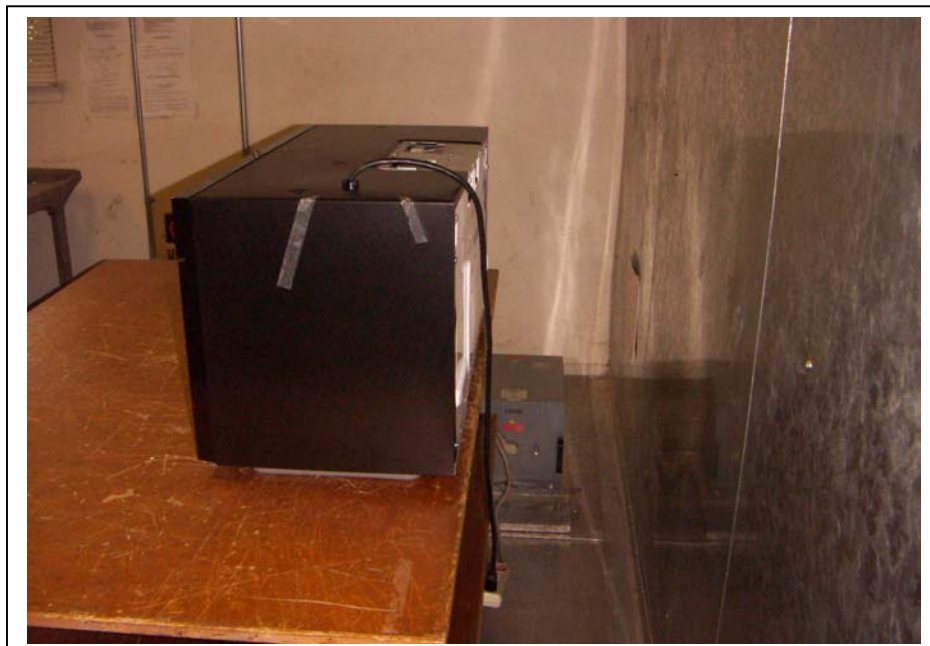
AC Line Conduction back