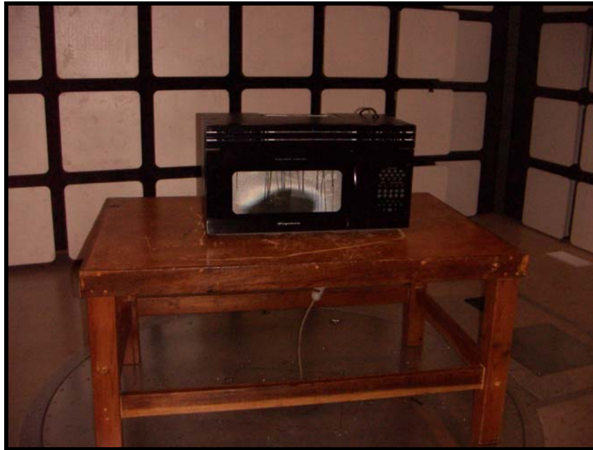
Radiation Measurement front