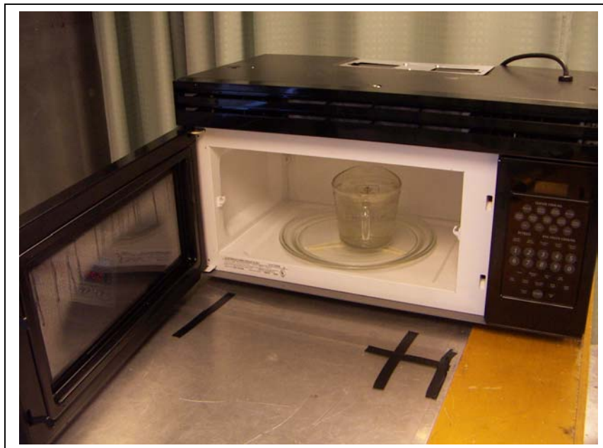
Operating Frequency Measurements