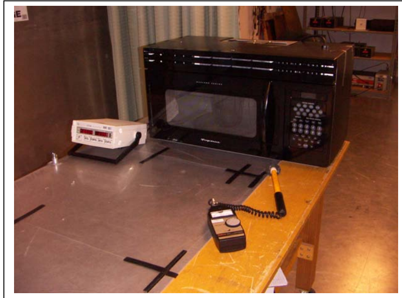
Radiation Hazard Measurement