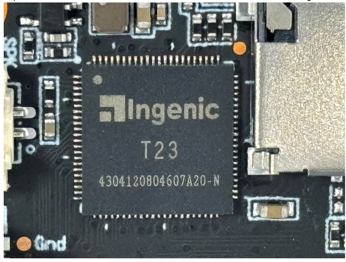
Page 2 of 4