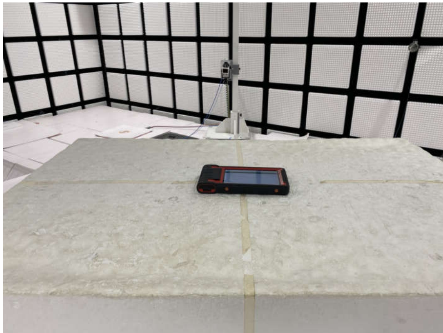
Radiated spurious emission Test Setup-3(18-30 GHz)