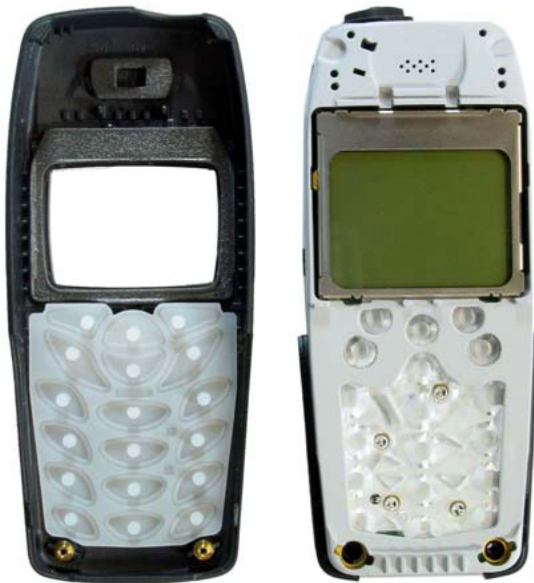
Exhibit 9: Internal Photographs