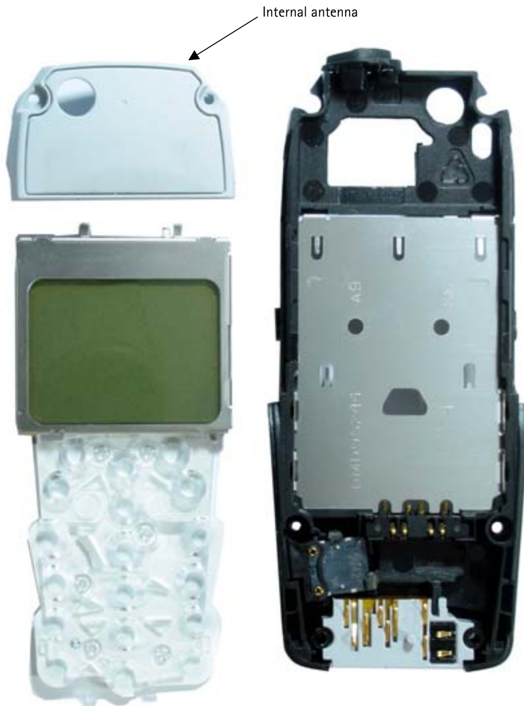
Exhibit 9: Internal Photographs