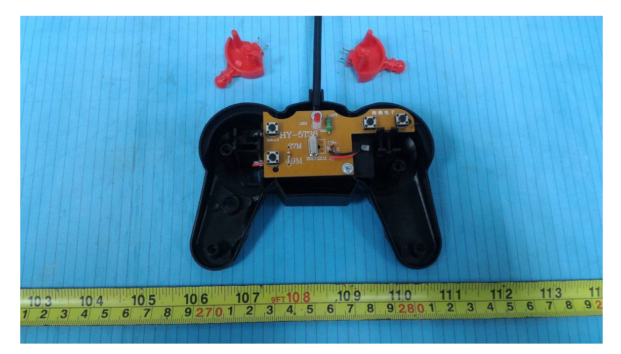
EUT – Cover off View 4