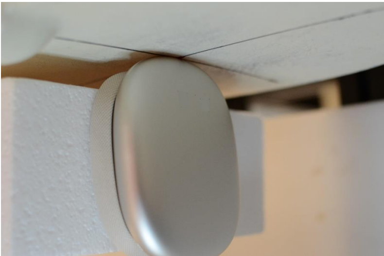
SAR Test Setup Photo 3: Bottom Edge Extremity SAR at 0.0 cm