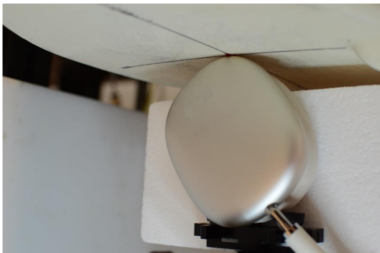
SAR Test Setup Photo 5: Antenna Touching Extremity SAR at 0.0 cm