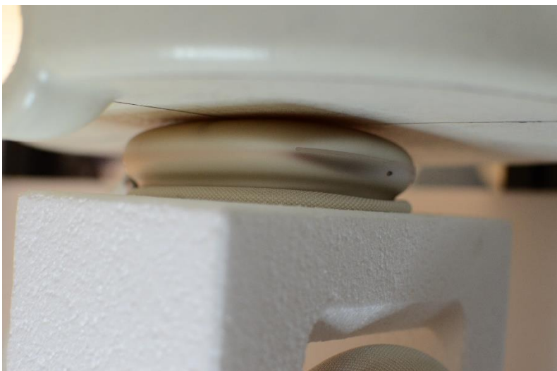
SAR Test Setup Photo 4: Logo Extremity SAR at 0.0 cm