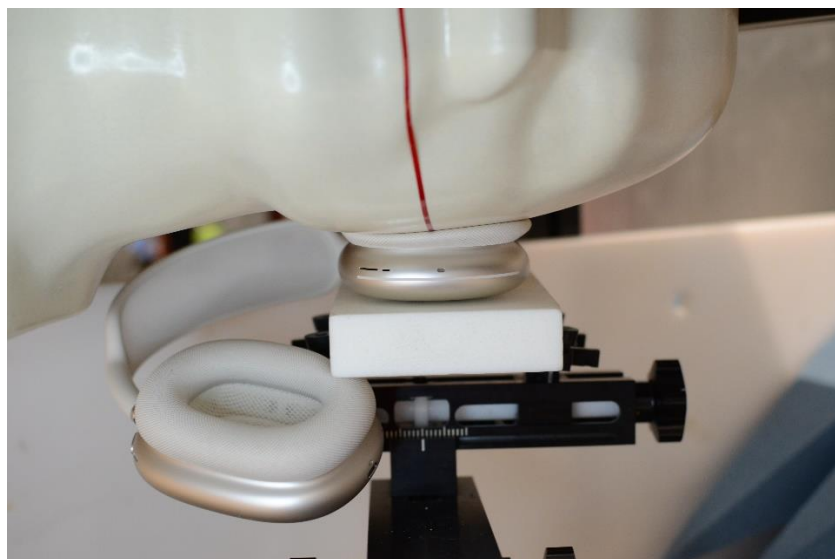
SAR Test Setup Photo 1: Left Head SAR Cushion Side at 0.0 cm