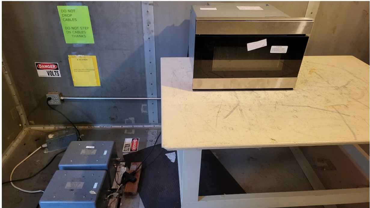
Figure 7. Conducted Emissions Measurement Photo

FCC Part 18 Subpart C APYDMR0173 22-0302 November 28, 2022 Sharp Manufacturing Company of America SMD2489ESC