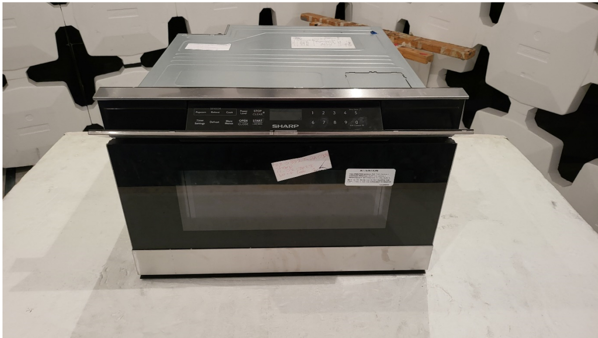
Figure 1. Radiated Emissions Measurement Photo (Front View)

FCC Part 18 Subpart C APYDMR0173 22-0302 November 28, 2022 Sharp Manufacturing Company of America SMD2489ESC