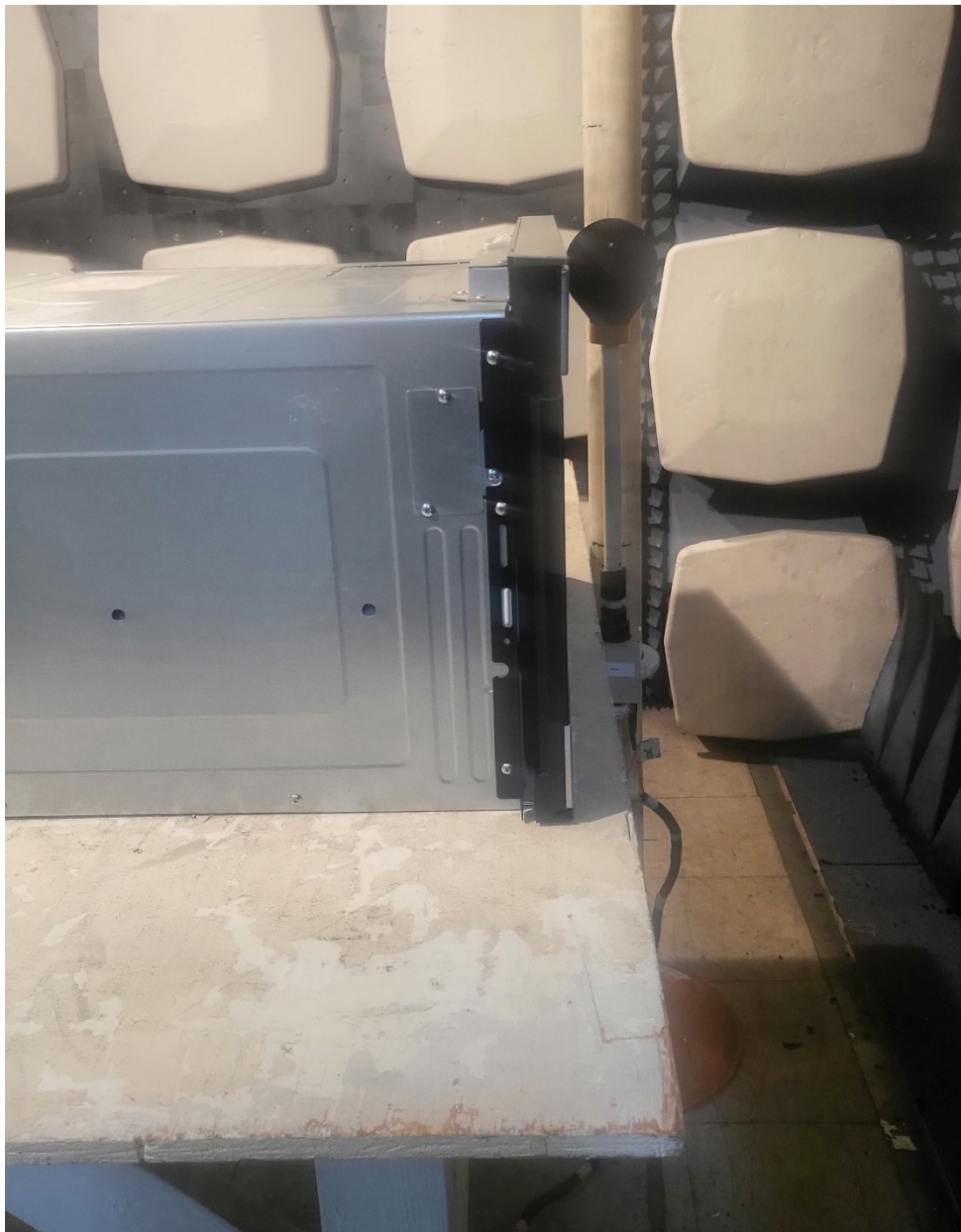
Figure 6. Radiation Leakage w/ RF Probe

FCC Part 18 Subpart C APYDMR0173 22-0302 November 28, 2022 Sharp Manufacturing Company of America SMD2489ESC