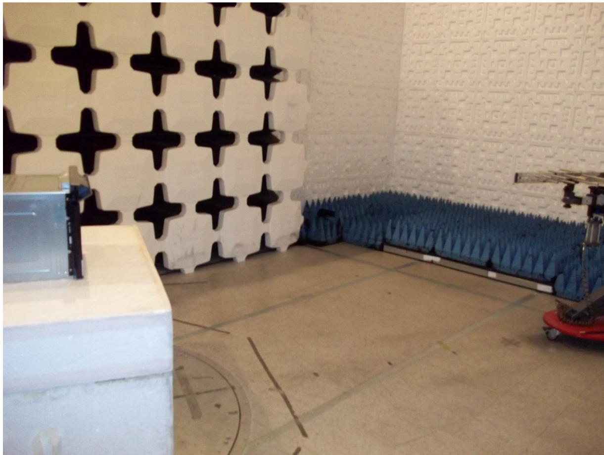
Figure 3. Radiated Emissions Measurement Photo, 200 to 1000 MHz

FCC Part 18 Subpart C APYDMR0173 22-0302 November 28, 2022 Sharp Manufacturing Company of America SMD2489ESC