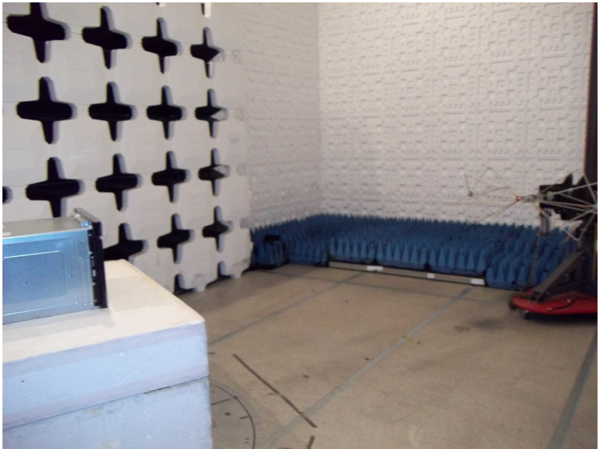
Figure 2. Radiated Emissions Measurement Photo, 30 to 200 MHz

FCC Part 18 Subpart C APYDMR0173 22-0302 November 28, 2022 Sharp Manufacturing Company of America SMD2489ESC