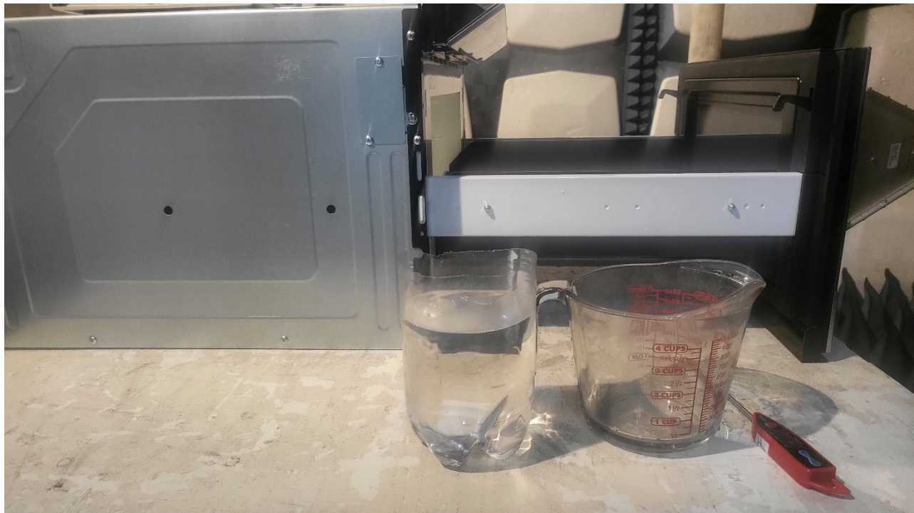
Figure 5. Output Power Test Configuration

FCC Part 18 Subpart C APYDMR0173 22-0302 November 28, 2022 Sharp Manufacturing Company of America SMD2489ESC