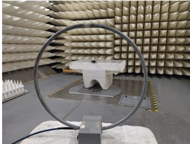
Photograph No.1 Setup for spurious emission field strength measurements in the anechoic chamber below 30 MHz