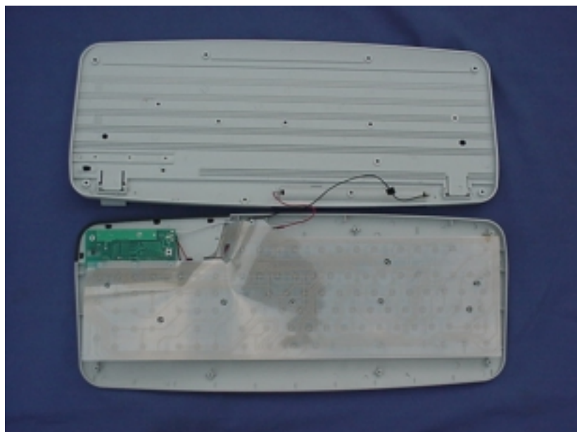
Inside of the EUT