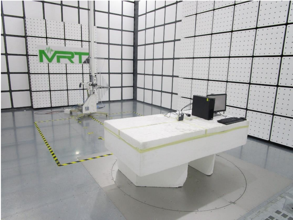
Description: Radiated Emission Test Setup for 1GHz~18GHz