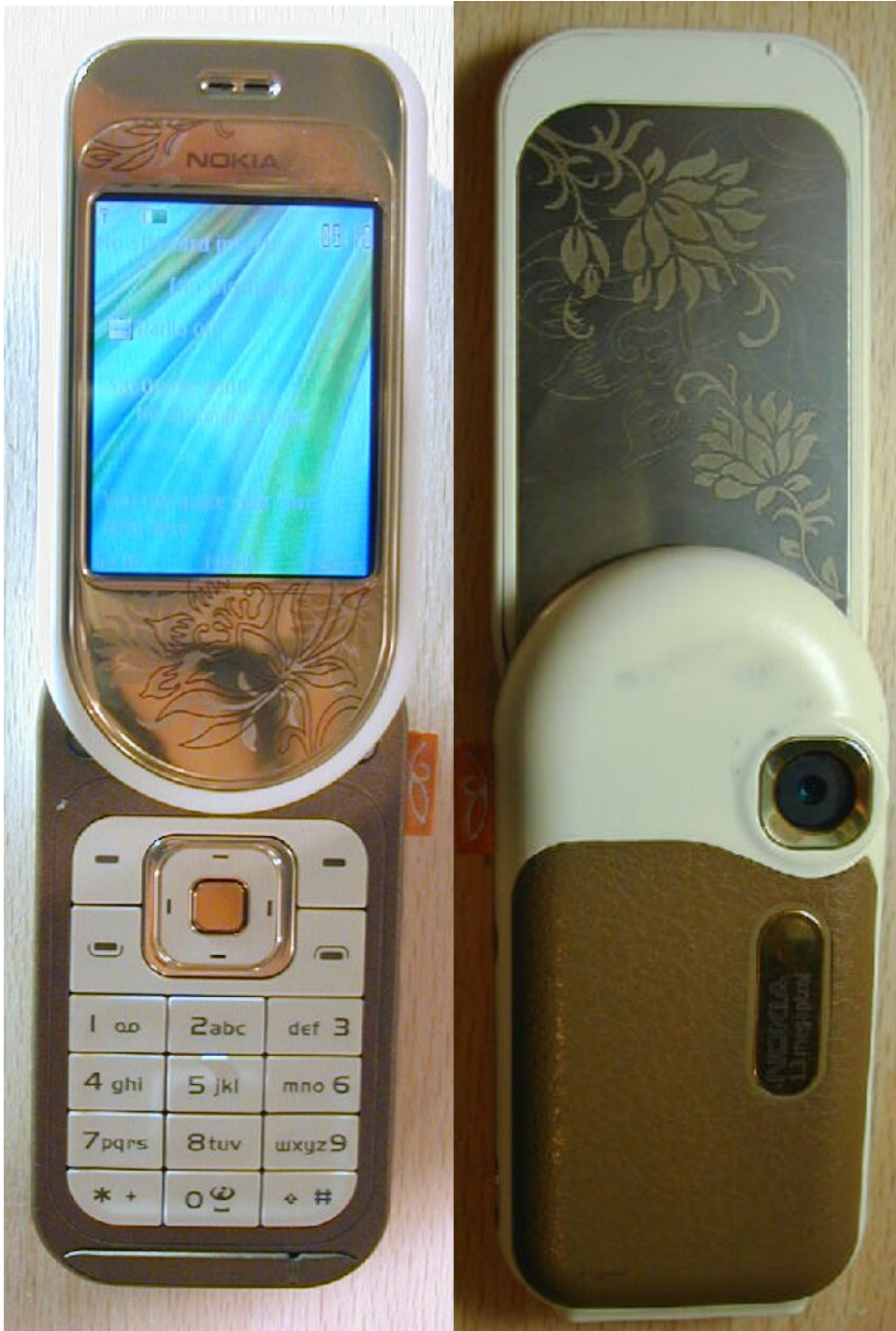
External photographs Exhibit 3 Applicant: Nokia Corporation