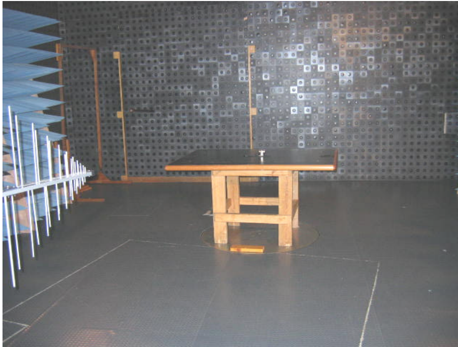
Photograph No.1 Test setup for 6 dB bandwidth measurements and for carrier field strength measurements