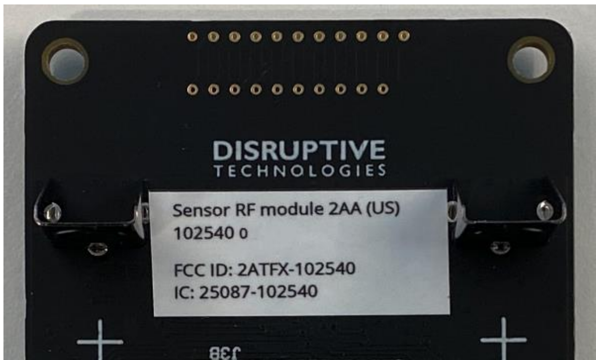
Figure 3: Picture of the label location