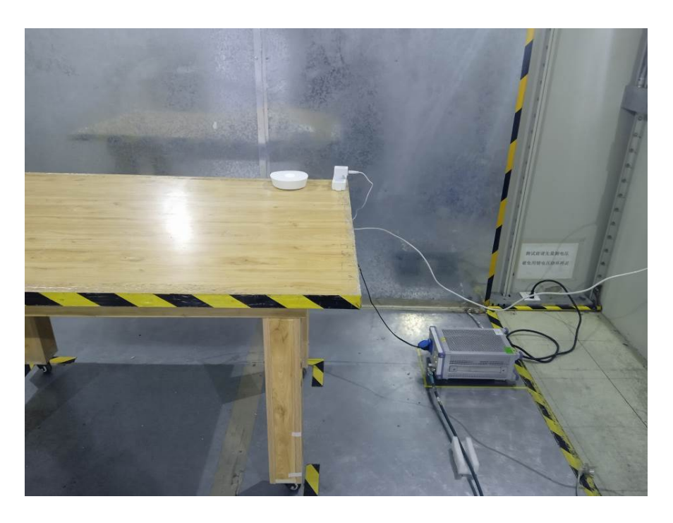
Conducted Emissions - Left View