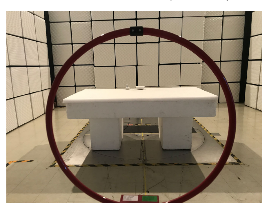
Radiated Emissions - Front View (Below 1 GHz)