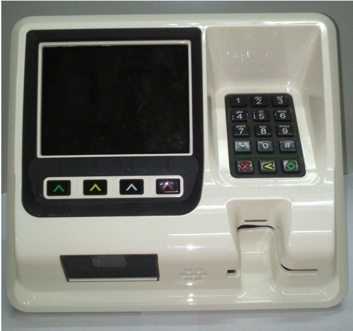
Assembled Unit from the Front