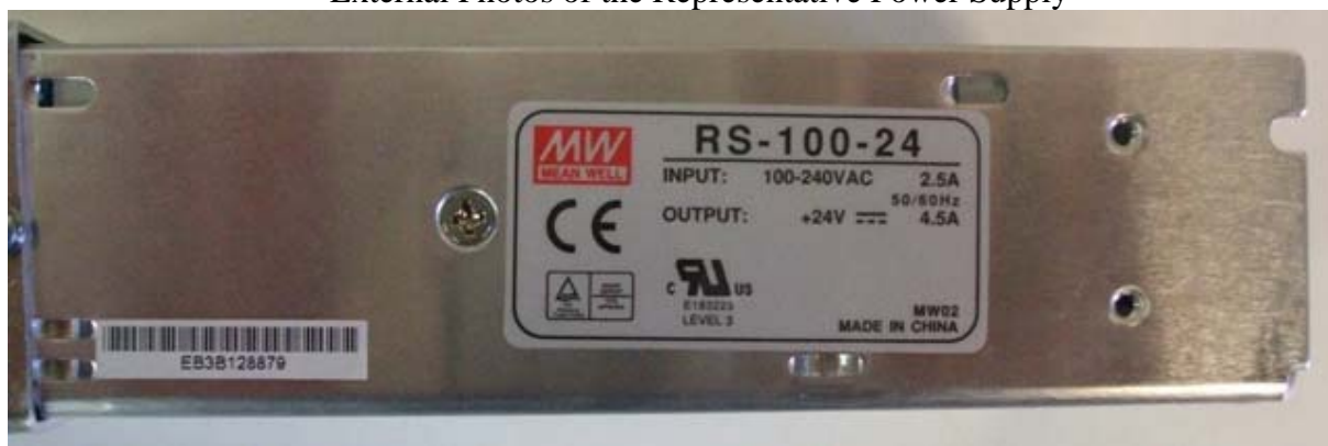
External Photos of the Representative Power Supply