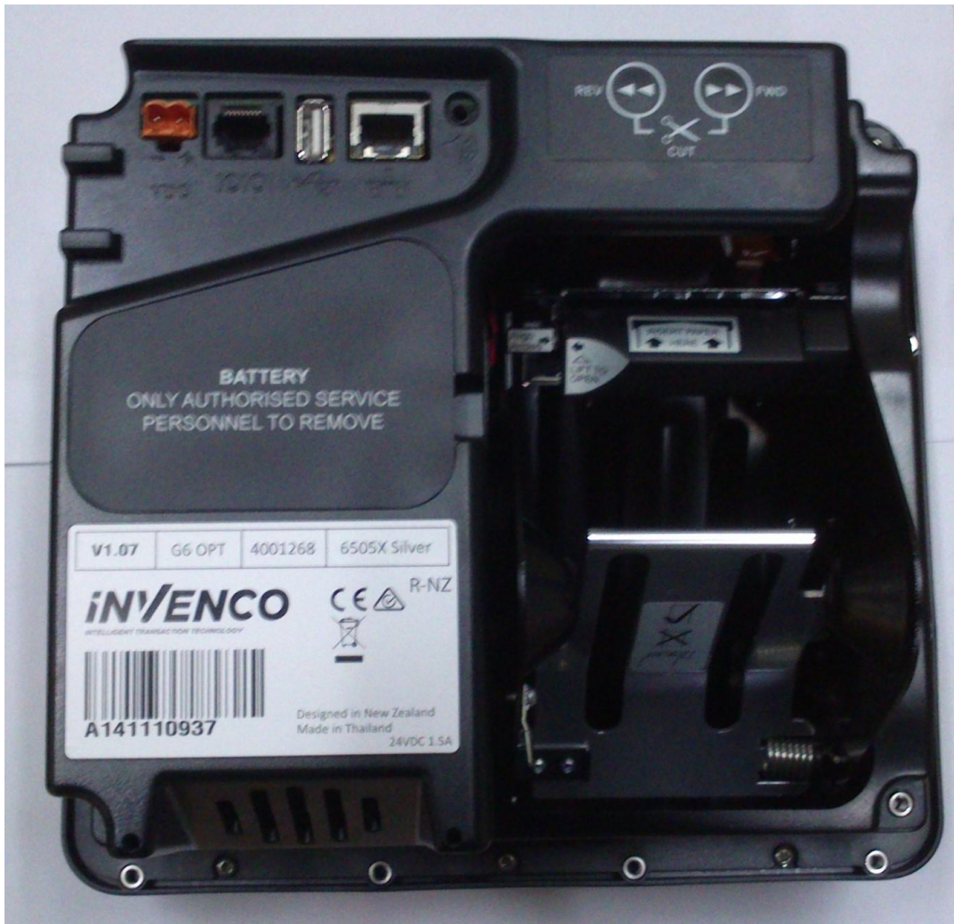
Assembled Unit from the Back