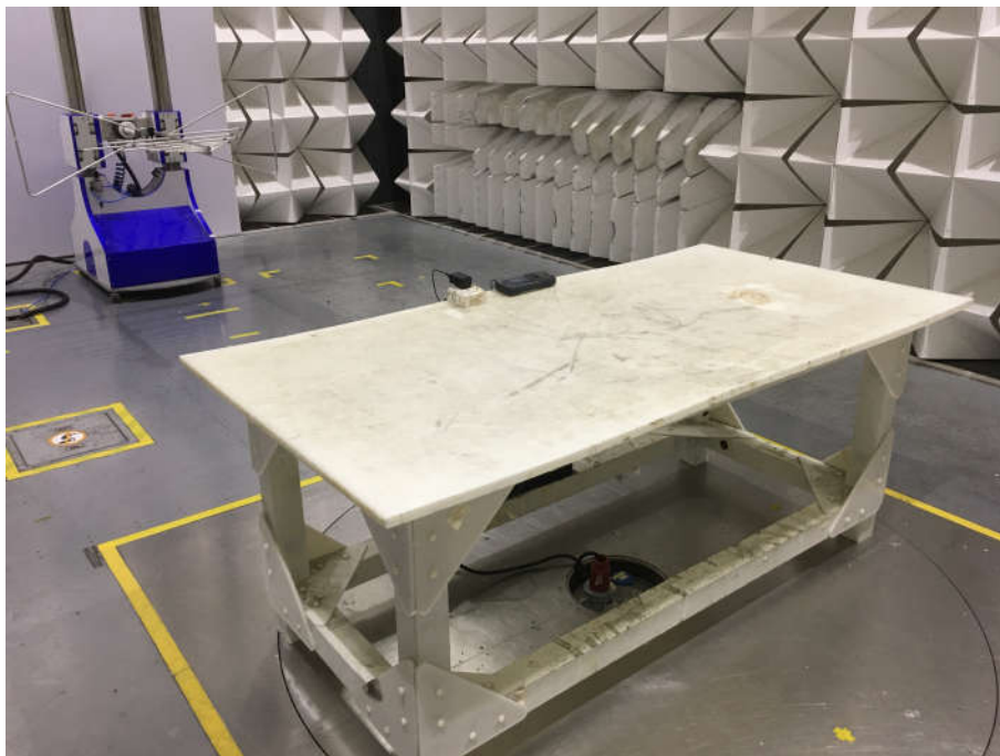
Radiated spurious emission Test Setup-2(Below 1GHz)