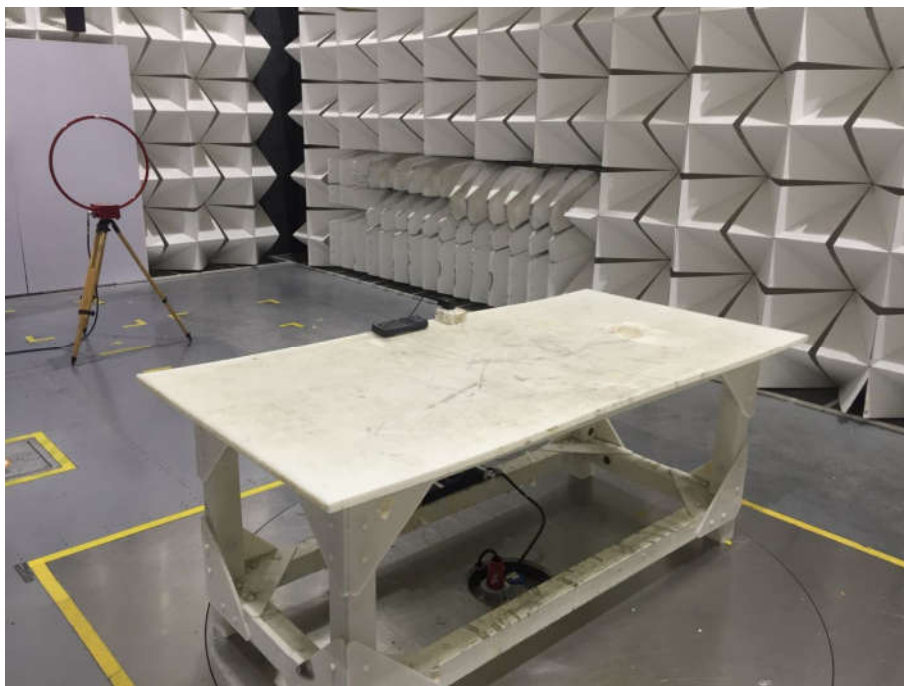
Radiated spurious emission Test Setup-1(Below 30MHz)