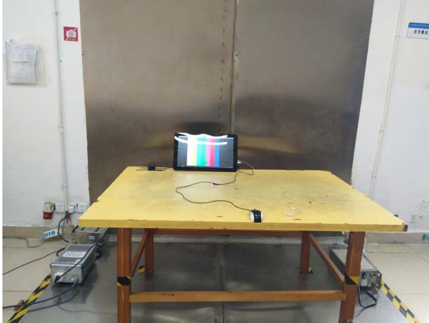
Conducted Emission Rear View