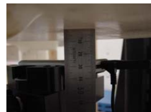
Figure 12. Body SAR