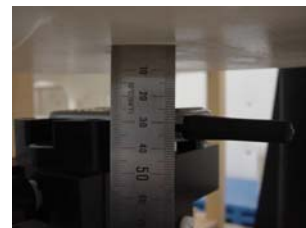
Figure 11. Mouth Face