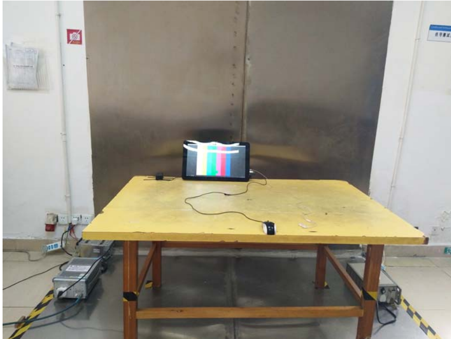
Conducted Emission Rear View