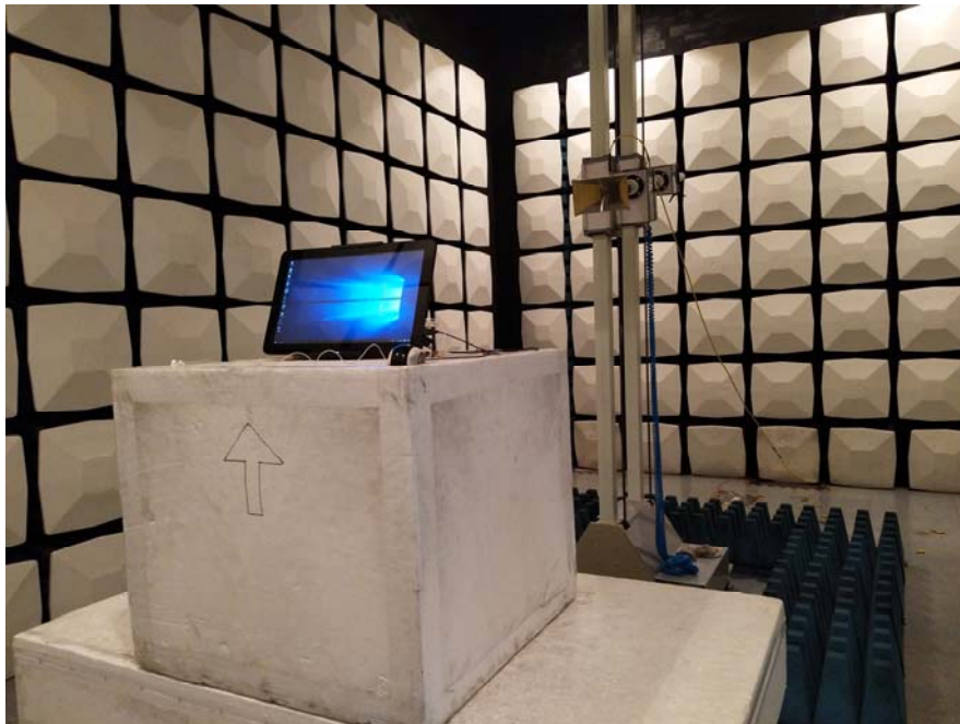
Radiated Emission View (18GHz-40GHz)