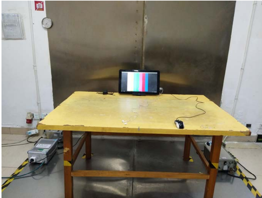
Conducted Emission Rear View