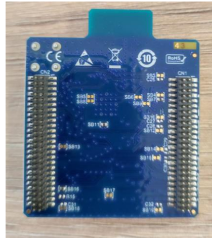
Tested module (Rear side)