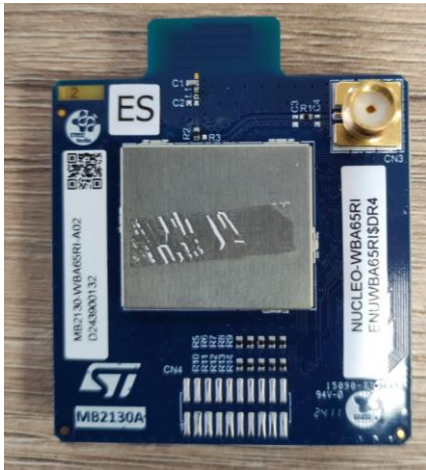
Tested module (Top side)