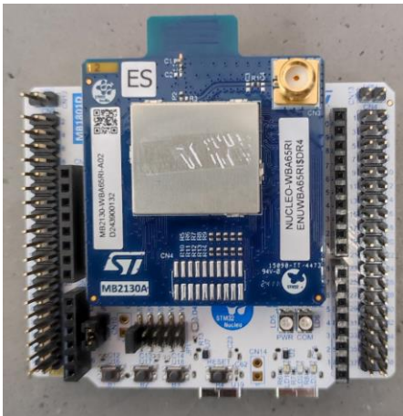
MB2130 with MB1801 support board