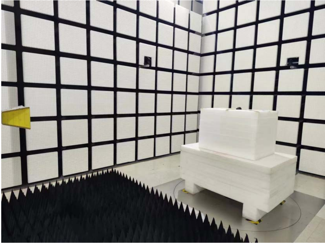
Radiated Emission 18-25GHz View PCBA_1