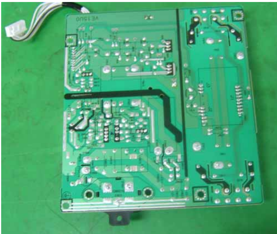
SMPS board bottom view