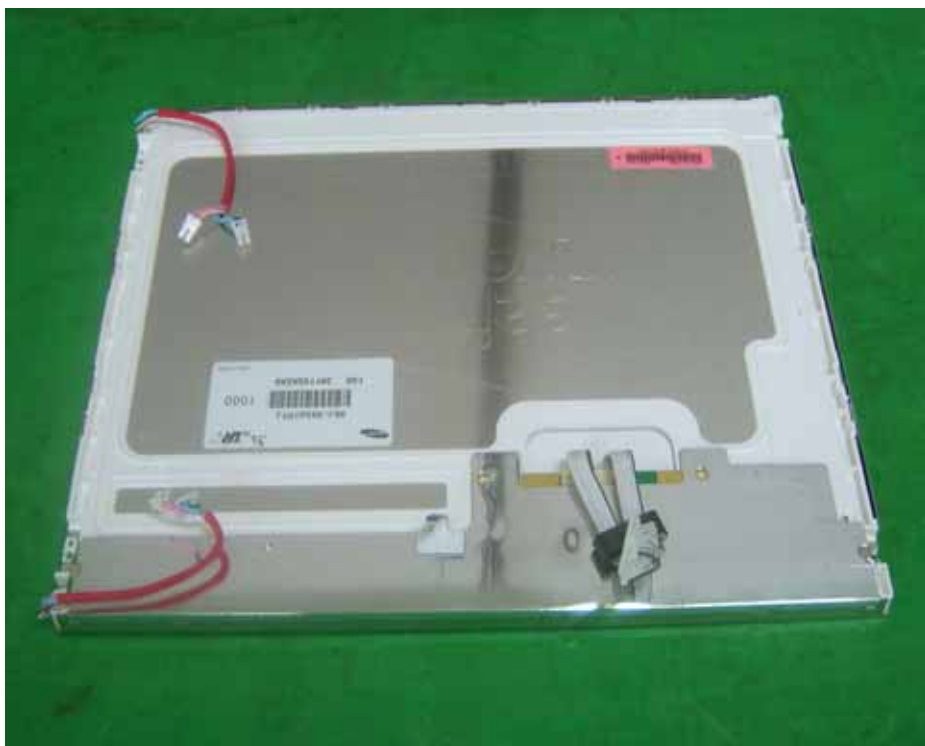
Panel rear view