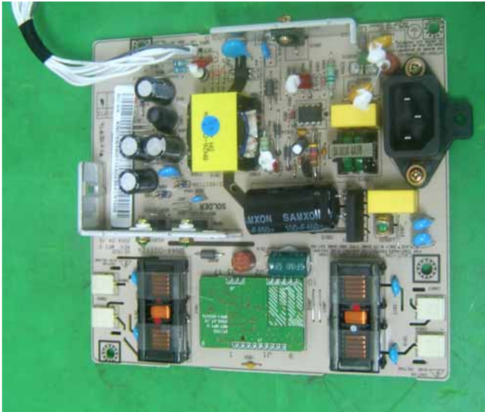
SMPS board top view