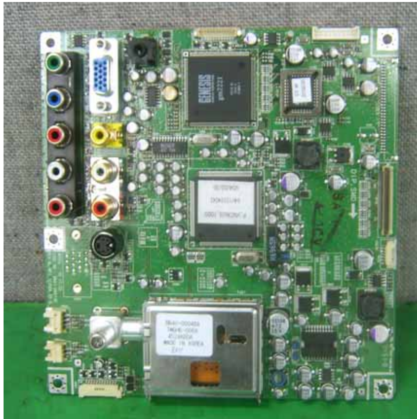
Visual board top view