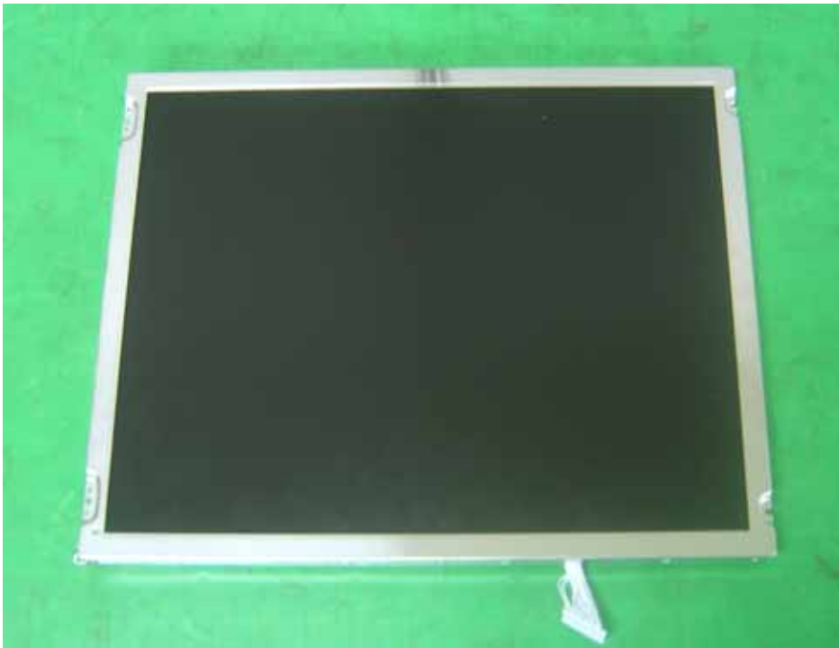
Panel front view