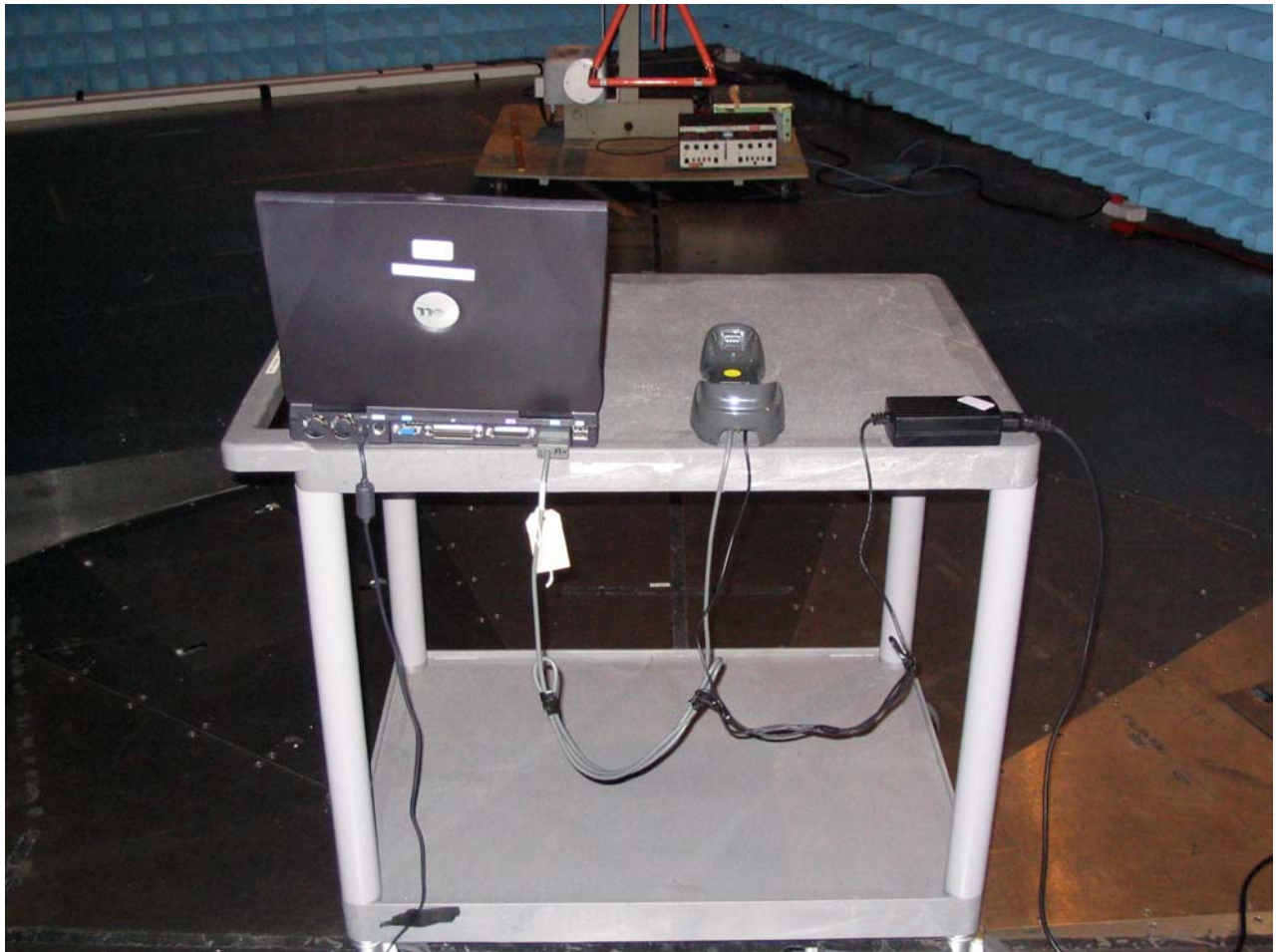
Spurious Radiated Emissions Set Up Photograph