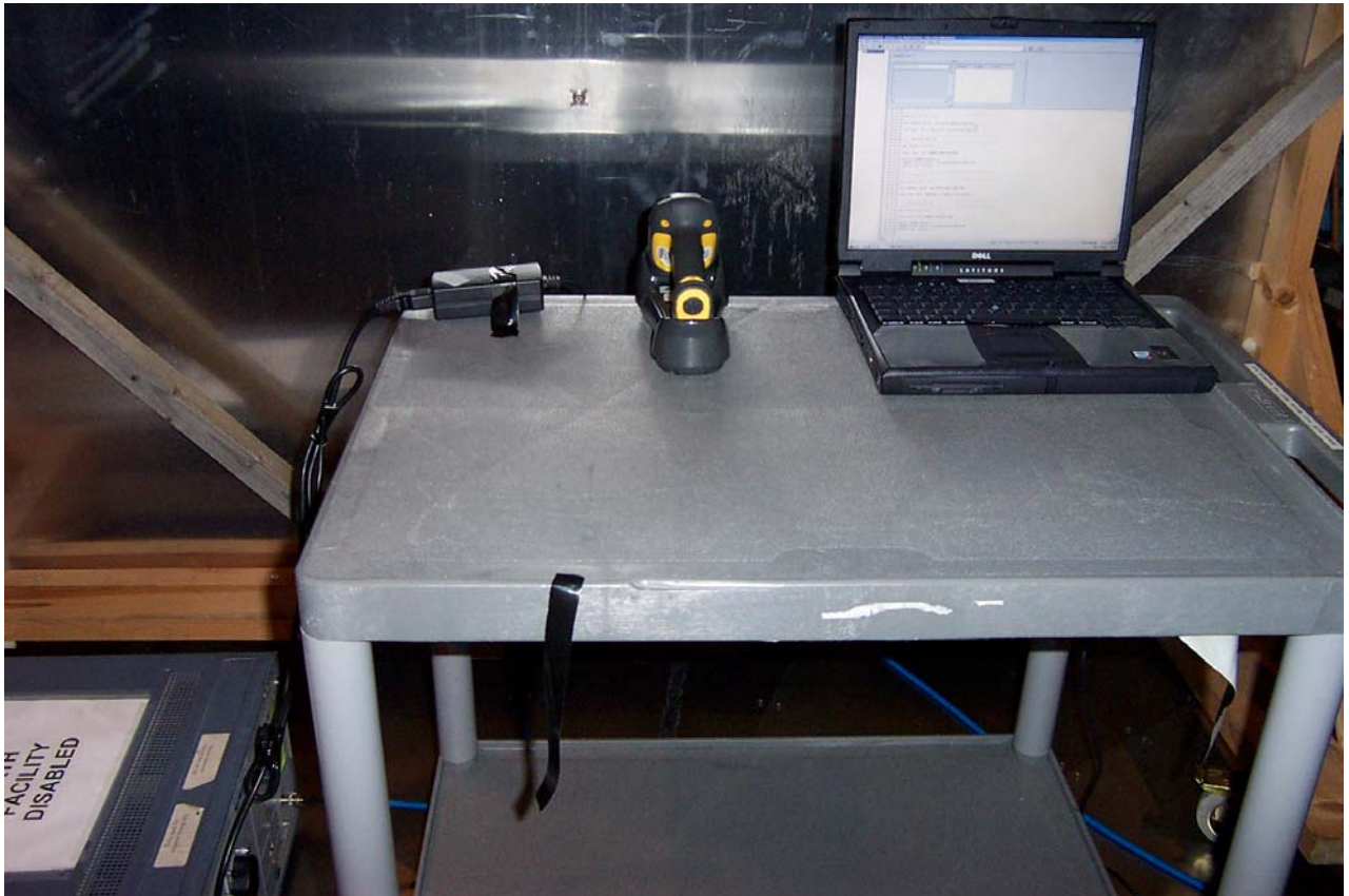
Conducted Emissions Set Up Photograph