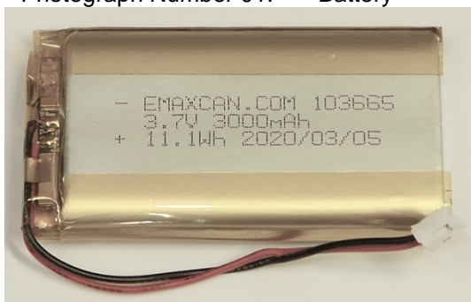
Photograph Number 01. Battery