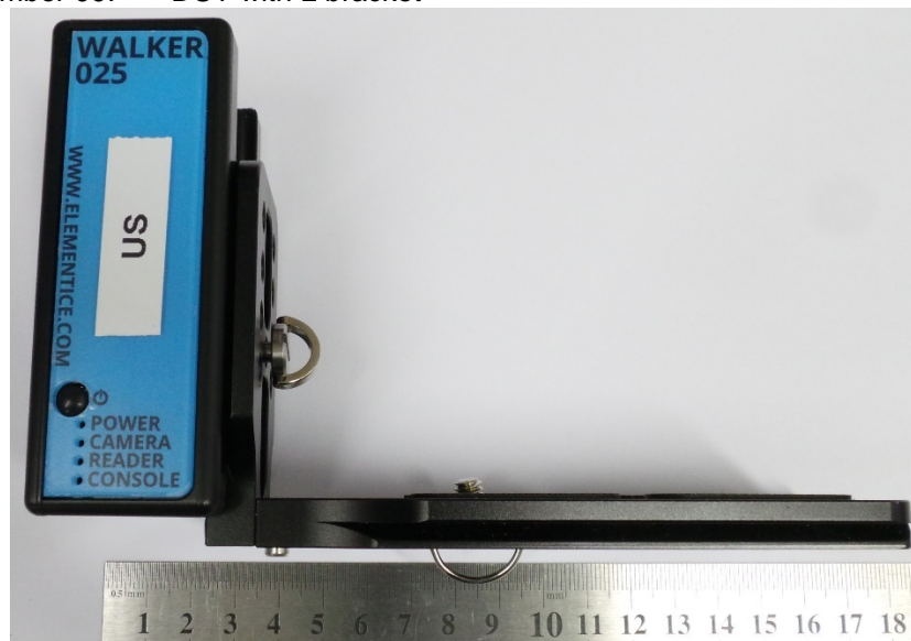
Photograph Number 10. DUT with example Host