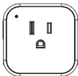
SW-ESW01N Z-Wave Binary Switch