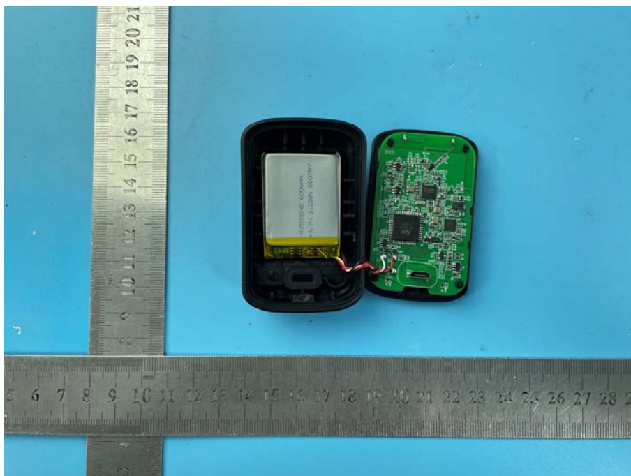
INTERNAL PHOTO OF SAMPLE PCB